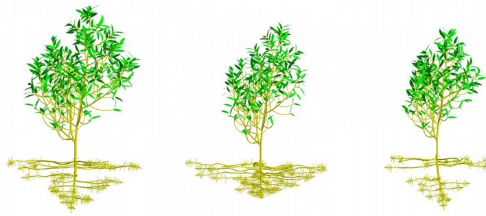
figure 2. same default plant species growing in optimal environment, with water stress and with light stress (RoCoCau+TOY)

The model has a good quantitative response in accordance to knowledge about tree plasticity. The proportion of root biomass is favored under drought conditions or more generally when trees grow on bad soil ( Leuschner et al, 2001). In such stressed environment, stems show frequently a reduced leafy area (Kozlowsky & Pallardy 2002). In shade environment, trees invest more in leaf surface in order to increase light foraging capacity (Poorter & Nagel 2000). Simulations show a permanent balance of both root and shoot system with regulation of architecture and resource capture (leaves, fine roots) according to the species capabilities facing different environmental stresses.