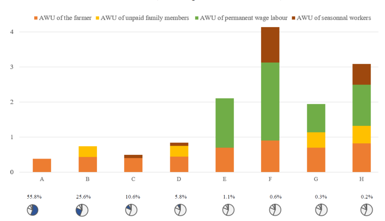
Figure 2: Labour regimes in small French farms and average agricultural work units by types of workforce (French agricultural census 2010)

In order to limit the number of labour regimes, we decided not to include Farm Work Companies (FWCs). In most cases, they work for very occasional and specific tasks such as clearing plots, mulching or harvesting. However, we recognise cases of outsourcing of work through FWCs and present them in Box 1. Figure 2 shows each of these labour regimes and their share in the total population of small farms in France.