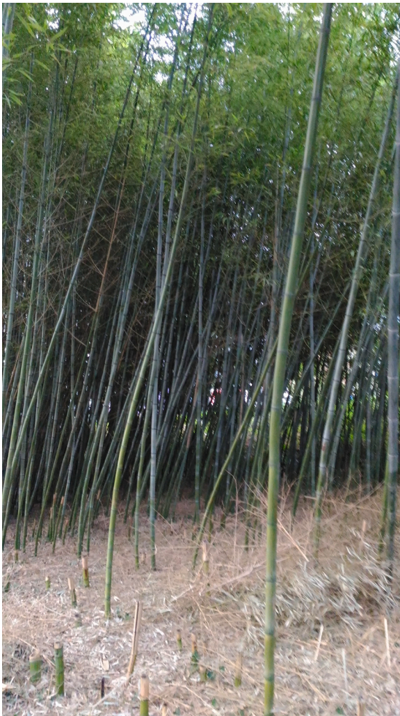
Fig. 2. Illustration of a collection site (site no 9).

for tick sampling within dense vegetation areas (see Fig. 2) than the dragging method, which requires areas free of obstacles such as trees, bushes or bamboo stems. Sampling was carried out on the ground, between bamboo stems or along trails surrounded by bamboo bushes, with a flannel flag (dimensions around 40 × 40 cm) mounted on a handle with a 45° angle. The time spent on flagging ranged from 5–160 min, including time needed to extract ticks from the flag with tweezers to put them in 70 % ethanol. Ticks were identified under an optical microscope (100X magnification) according to the morphological keys provided in Heylen et al. (2014a), Pérez-Eid (2007) and Estrada-Peña et al. (2017). A site was considered positive as soon as a single individual from any stage of I. frontalis was found.