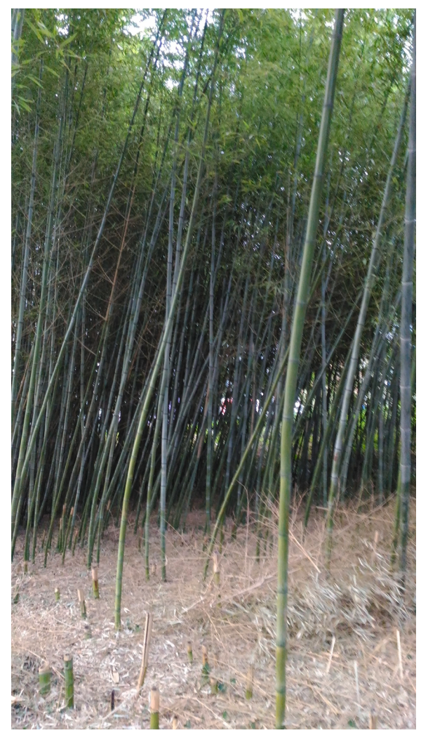
Fig. 2. Illustration of a collection site (site no 9).

for tick sampling within dense vegetation areas (see Fig. 2) than the dragging method, which requires areas free of obstacles such as trees, bushes or bamboo stems. Sampling was carried out on the ground, between bamboo stems or along trails surrounded by bamboo bushes, with a flannel flag (dimensions around 40 \times 40 cm) mounted on a handle with a 45° angle. The time spent on flagging ranged from 5–160 min, including time needed to extract ticks from the flag with tweezers to put them in 70 % ethanol. Ticks were identified under an optical microscope (100X magnification) according to the morphological keys provided in Heylen et al. (2014a), Pérez-Eid (2007) and Estrada-Peña et al. (2017). A site was considered positive as soon as a single individual from any stage of I. frontalis was found.