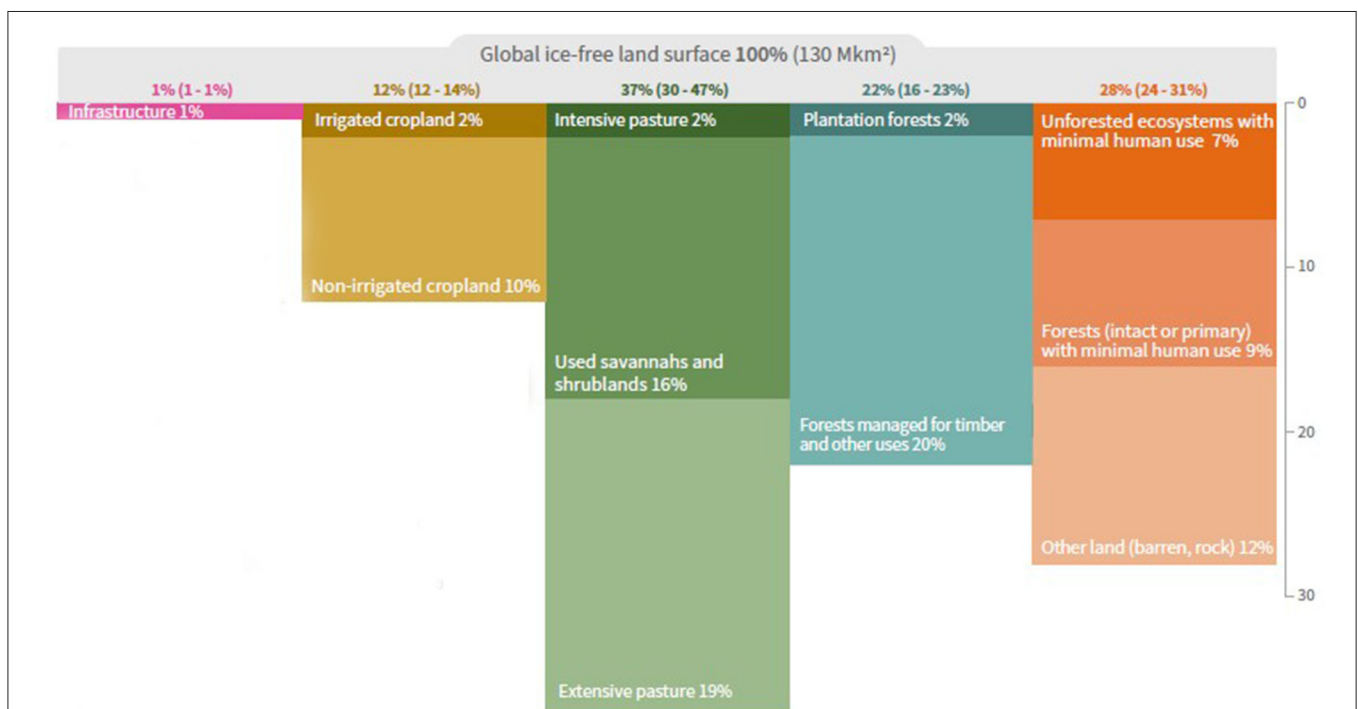
FIGURE 2 | Global, ice-free land area use 2015 (IPCC, 2019). (Each bar represents a broad land cover category; the numbers on top are the total percentage of the ice-free area covered, with uncertainty ranges in brackets and ordered along a gradient of decreasing land-use intensity from left to right).

In the context of the desired evolution in climate-smart food systems (outlined in the previous section) we identify and discuss three pertinent issues for temperate lowland grazing systems. There are many others possibilities such as, for example, to better utilize the complementarity within integrated crops-livestock farming (Ryschawy et al., 2017), but we believe that the required increase in resilience and environmental benefits in temperate lowland grazing based dairy systems will be primarily based on the adaptation of livestock, feeding systems and ecosystem services. We discuss three specific changes