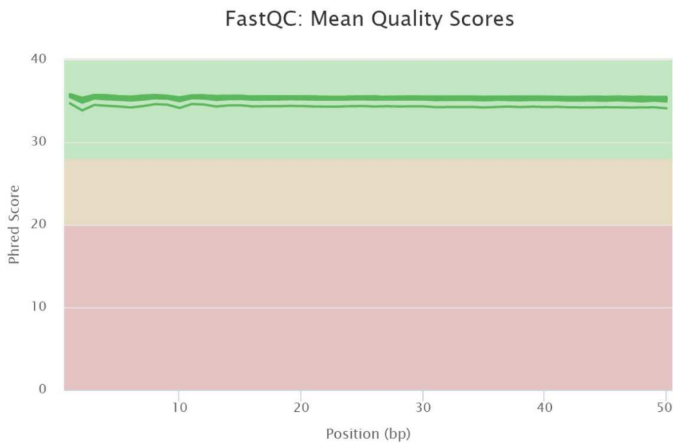
Figure 2: Overview of the range of quality values across all bases at each position in the fastq files obtained from FastQC.