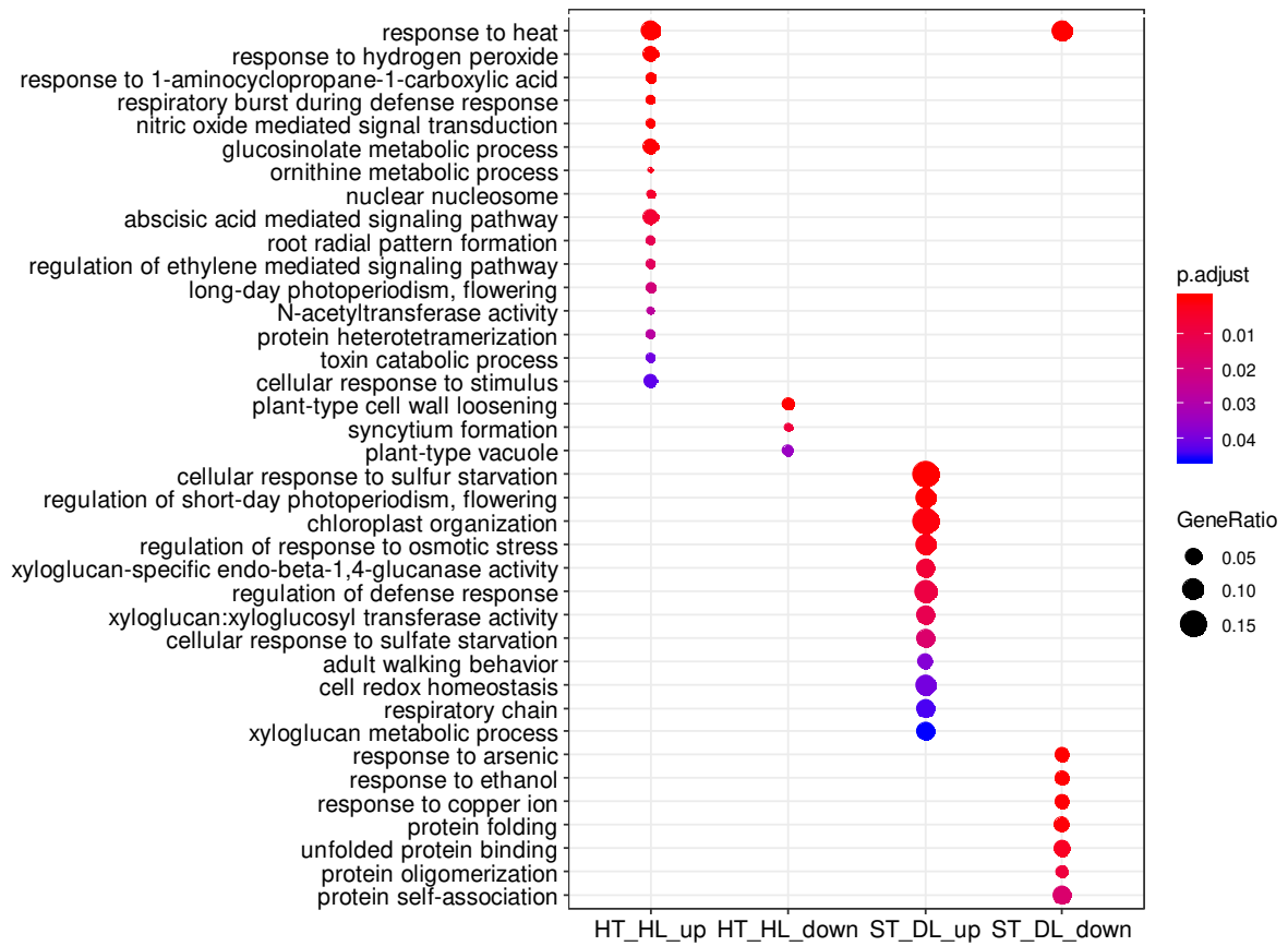
Figure 4. Major overrepresented biological functions of -DEGs in the endosperm of seeds from fruits ripened under different light/temperature conditions compared to standard conditions. Enriched GO Terms were identified using ClusterProfiler algorithm with a hypergeometric test and a Bonferroni p-value adjustment threshold set at 0.05 to control false positive rate. DL = dim light; HL = high light; HT = high temperature; ST = standard temperature.