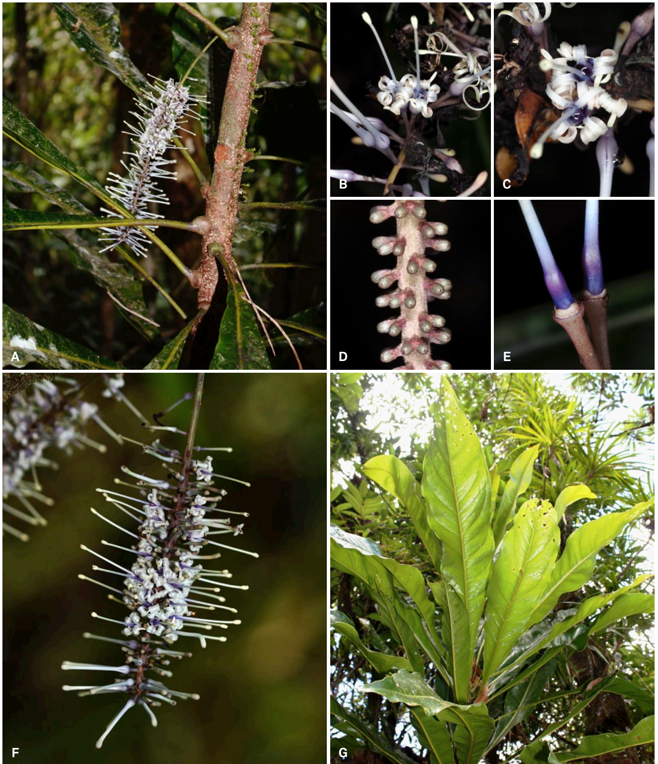
Fig. 2. – Virotia azurea H.C. Hopkins & Pillon. A. Inflorescence arising from a leaf axil; B. A flower-pair at anthesis plus flower buds; C. Pair of flowers (note helically curled tepals and nectar); D. Very young floral buds; E. Two purple ovaries (note disc at base) and white styles; F. Inflorescence; G. Under surface of foliage.