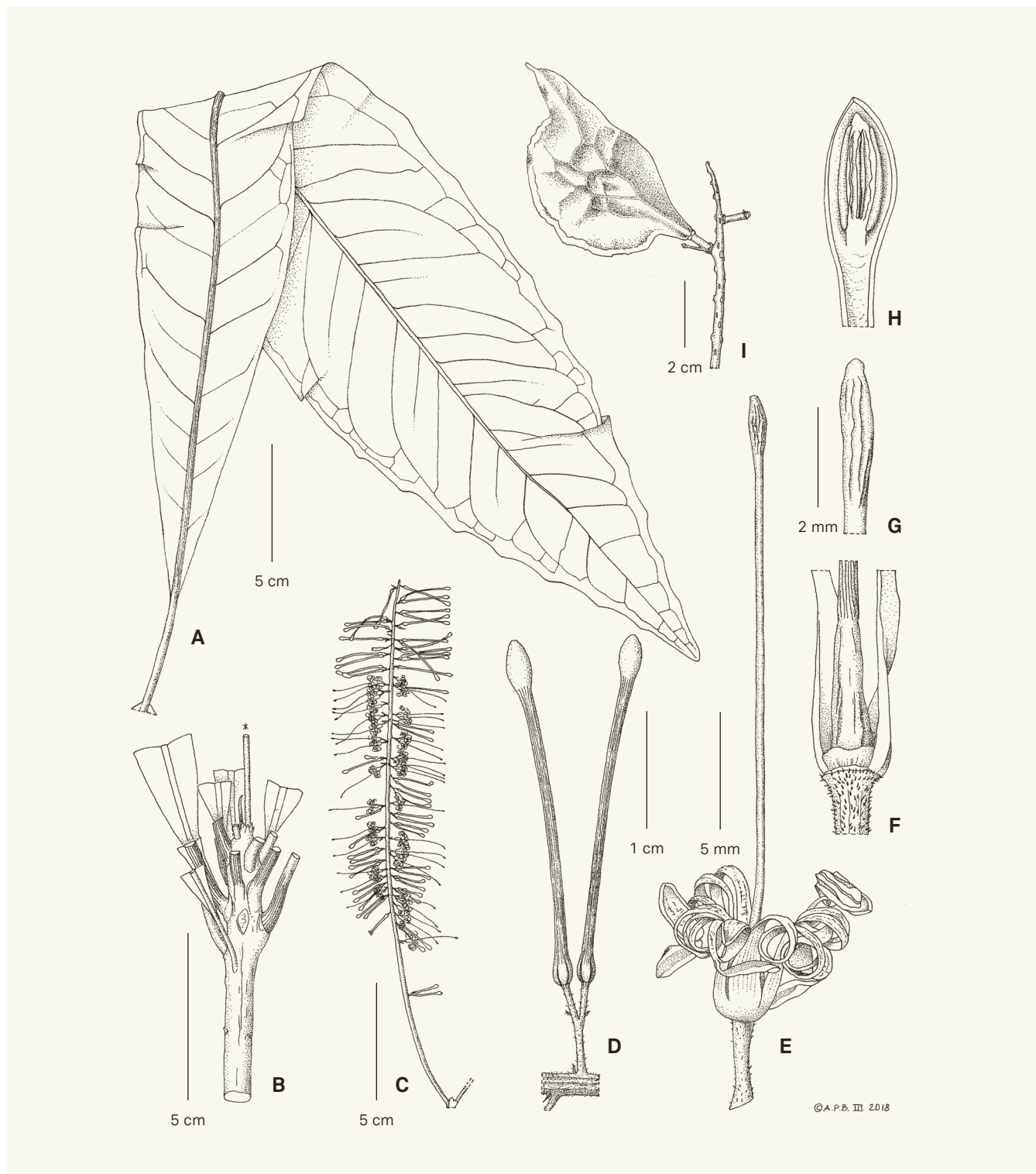
Fig. 1. – Virotia azurea H.C. Hopkins & Pillon. A . Leaf; B . Apex of a shoot showing the arrangement of leaf bases and the base of an inflorescence axis (*); C . Inflorescence (conflorescence), the flowers post-anthesis; D . A flower-pair immediately prior to anthesis, their peduncle subtended by a minute bract and a small bract present at the base of each pedicel; E . A flower post anthesis, the tepals all helically curled; F . Base of a flower, two tepals removed to show the ovary and the cup-like disc around it; G . Apex of the style, slightly swollen and ridged, forming the pollen presenter; H . Distal part of a tepal, inner surface, with the anther attached; I . Immature fruit, note prominent beak. [A, C, E–H: Gâteblé et al. 87, P; B: Munzinger et al. 1462, P; D: MacKee 15159, P; I: MacKee 46274, P] [Drawing: Andrew Brown]