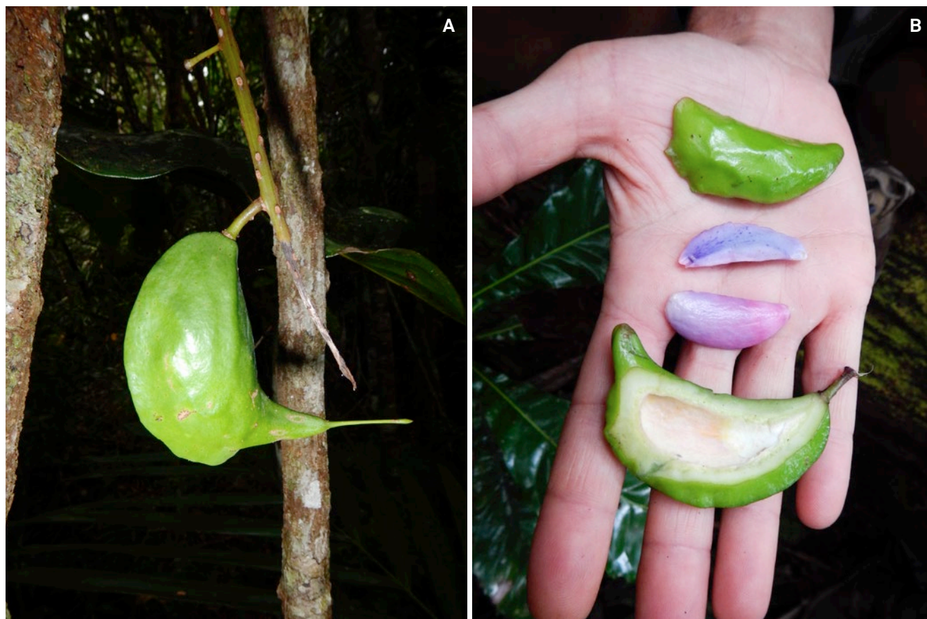
Fig. 3. – Vrotia azurea H.C. Hopkins & Pillon. A. Fruit; B. Fruit cut open to reveal the bluish mauve cotyledons.

lobes ovate, thickened, 2.5 \times 1.5 mm, tepal lobes below the tip long and narrow, curling helically, blue to white (including light blue, mid-blue and white-violet), their inner surface glabrous. Stamens : free part of the filament very short, each one inserted towards the base of the ovate tip of a tepal; anthers 2 \times 1 mm, the connective shortly prolonged at the apex. Disc an erect, hypogynous cup or collar, thin, glabrous, slightly undulate along the top margin to shallowly 4-lobed or the lobes sometimes splitting to the base, maximum height 0.4 mm. Gynoecium : ovary cylindrical-conical, 1.5\text{--}2.5 \times 0.8 mm, glabrous or with a few minute hairs, blue or violet; style cylindrical, long and slender, 21\text{--}30 \times 0.5 mm, glabrous, \pm white, the distal 2.5 mm forming a slightly swollen pollen presenter, this glabrous and shiny black with longitudinal ridges when dry; stigma a short terminal slit. Fruit few per infructescence, each borne on a thickened pedicel/peduncle c. 8 mm long, somewhat laterally compressed, crescent shaped or ventral part \pm elliptic in outline with a marked beak at the end of the dorsal margin, c. 7.3 cm long (including the beak 1.5 cm long) \times 3.5 cm deep (between the mid-points of the ventral and dorsal margins); epicarp bright or dark shiny green, glabrous; seed (based on Gâteblé et al. 449) 1 per fruit, almond-shaped,