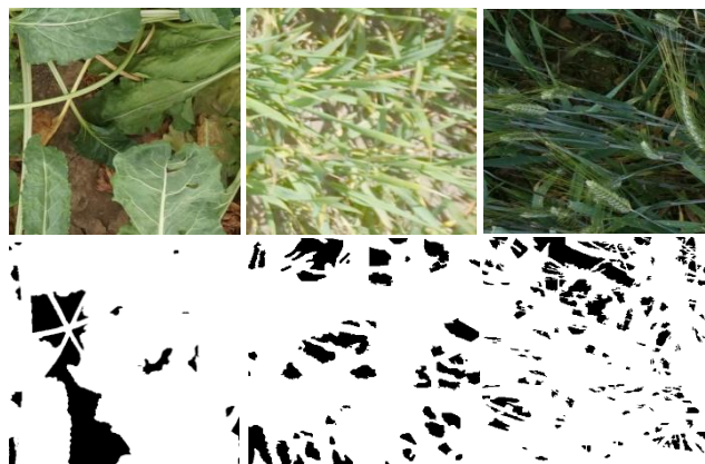
Figure 1 Examples of images and their corresponding annotated masks

2.2 Annotation strategy: Thirteen experts precisely annotated the 75 images using a custom improved version of the JavaScript annotation tool provided by [4]. To avoid annotation bias due to subjectivity, at least two independent experts reviewed each annotated image. The dataset was annotated following a simple rule: labeling all the pixels belonging to a plant as vegetation (including flowers, spikes, and dried leaves) and the rest as background.