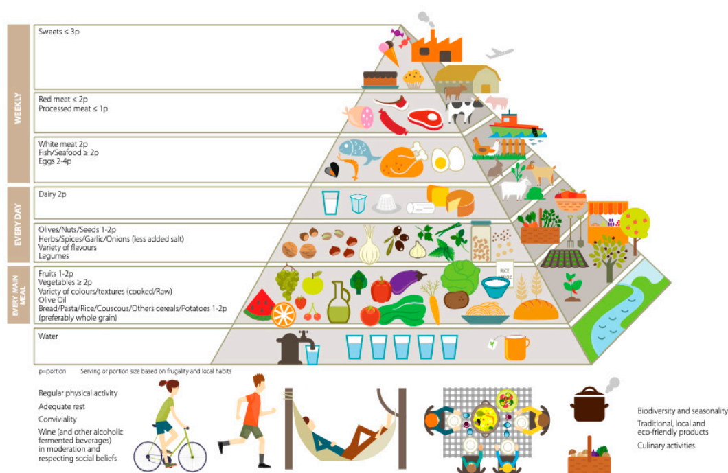
Figure 2. New Pyramid for a Sustainable Mediterranean Diet.