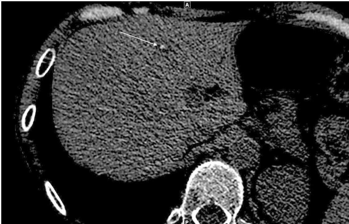
Figure 2. Calcified lesion in the liver two months after transplantation: Axial unenhanced CT showing a small low-density nodule within the liver and the development of a small central calcification within the lesion (arrow).

The patient lives in a rural part of the French Massif Central region (France), a historic endemic zone for alveolar echinococcosis [8,9]. Direct interrogation at the time of diagnosis found exposure to several risk factors for AE prior to her transplantation and thereafter [10]: ownership of two dogs and four cats that were dewormed regularly but were free to roam outdoors and hunt unattended including in her unfenced garden visited by foxes; living in a house close to fields; vocational activities in the forest and growing leaf and root vegetables. She worked as a veterinarian for pets prior to transplantation but did not resume work before seven months post transplantation. She reported washing produces from her garden and good hand hygiene after handling and playing with dogs and cats. Alveolar echinococcosis has become less frequent in the Massif Central over the last two decades; therefore, this particular parasitic etiology was not at the forefront during differential diagnosis.