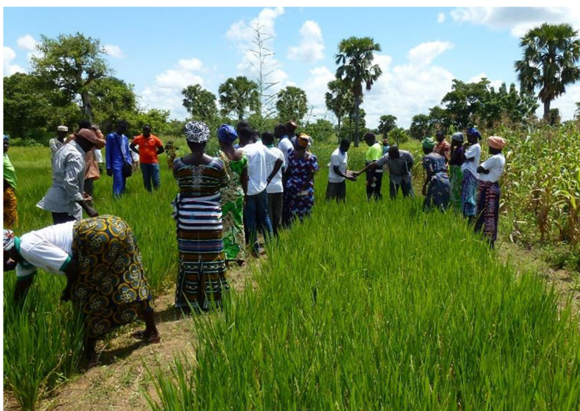
Fig. 1 Farmer Field Schools (FFS) are a participatory field-based approach that seek to support farmers' competences and rely on field observations, collective action and experiential learning

Increasing interest in more integrative assessment methods has led to the development of alternative impact assessment approaches (Mancini and Jiggins 2008). The analysis of temporal dynamics in farmers' changes in practices may be useful to identify triggers of change, constraints to adoption, and adaptations of practices to the farmer's own priorities (Chantre et al. 2015; Mawois et al. 2019). Such a comprehensive assessment of an innovation support intervention can also