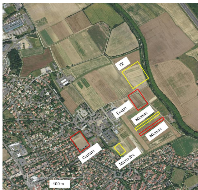
Figure 1 An aerial view of the experimental site. The areas delimited in red and yellow represent the location of the field plots entirely sown with soybean, in 2018 and 2020, respectively. The information reported next to the delimited areas represent the historical names of the plots assigned to facilitate experimental setup (see Table 1). Although the size of the field plots grown to soybean was different within and over the two years, the area used for the counting of post-emergence damage was the same (see Fig. 2). Field plots were located between the residential area and the Midi canal (green strip on the right that is the tree hedge along the canal). A small strip of bushes, trees and hedgerow are located along the Midi canal that represent a roosting area for vertebrate pests. At the level of the experimental site, in both years, neighbouring soybean plots were sown with commonly grown winter-sown (soft and durum wheat, pea, faba bean) and spring-sown (sunflower, maize, sorghum) field crops in the region. ©IGN, 2020.

Full-size DOI: 10.7717/peerj.11106/fig-1