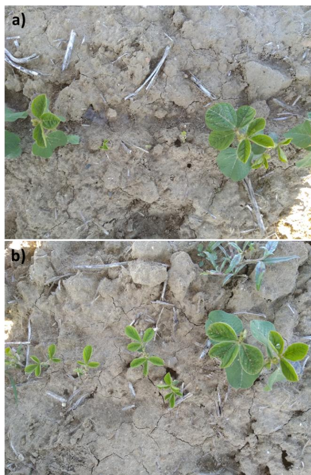
Figure 5 Heterogeneous growth stage of soybean seedlings due to post-emergence seedling damage by vertebrate pests. Damaged seedlings partly compensate their growth that mainly depends on the pest type and growth stage during which the damage occurred.