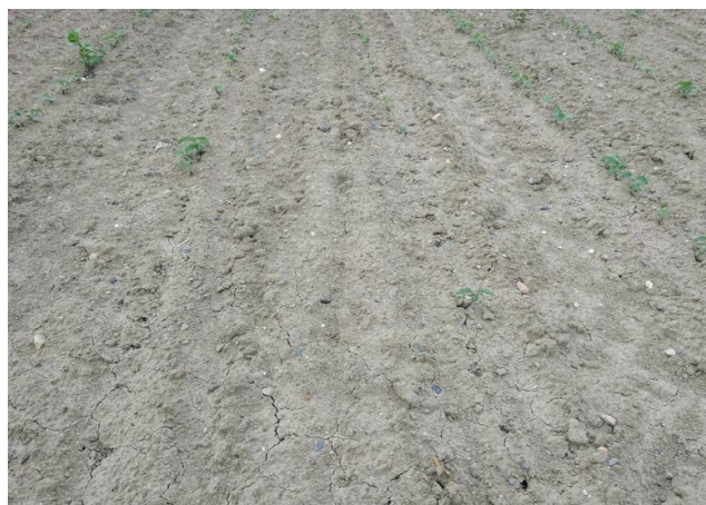
Figure 4 Post-emergence seedling damage due to the common wood pigeon can lead to total crop establishment failure with severe direct (re-sowing costs, yield losses) and indirect (increased weed pressure during the cropping season with increased weed seedbank for the following years) economic consequences for farmers.

Full-size DOI: 10.7717/peerj.11106/fig-4