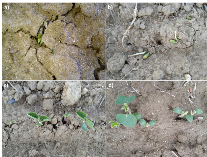
Figure 3 Characteristic post-emergence seedling damages caused by the common wood pigeon (A, B) and the European hare (C, D) on soybean. The cotyledons can be partially damaged by birds during the emergence phase (A) or the entire seedling can be uprooted and scattered on the seedbed surface (B). The damage is reversible to some extent in the first case while it is irreversible in the second case. Following emergence, seedlings can be damaged by wild hares that chew seedlings or seedling parts without uprooting them. Damaged seedlings due to wild hares recover their growth provided that the damage is occurred above the first node although this may have an impact on crop productivity.

Means followed by the different letter are significantly different at p < 0.05 .