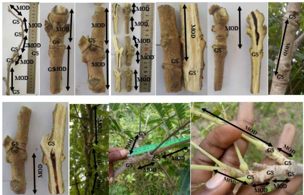
Figure 2. Images related to morphology and growth boundaries or growth stops (GS) of macro-anatomical markers or Growth modules (MOD) in Parkia biglobosa .

Statistical analyses were first performed using one-dimensional descriptive statistics and linkage analysis methods using XLSTAT 2020 version 7.5. The