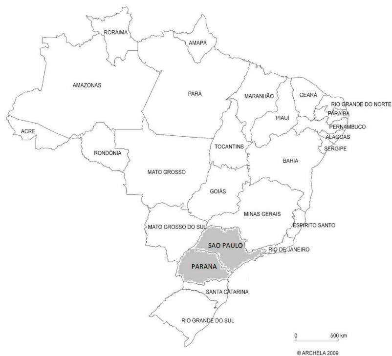
Figure 2. Map of Brazil and states where data was collected.

For each section, we asked the owner to describe not only the current state of their farm organization and the agri-environmental practices used but also the main stages and the processes of changes, when relevant. In other words, this historical analysis informed us about the manager's perception regarding the various topics discussed and helped us to better characterize the mechanisms that influence the adoption of practices by farmers. Farmer's interviews and farms visits took from 3 to 5 h. During the farm visits, observations are made of the farmer's practices, and crosschecking are done with the farmer's declaration. When it is possible, discussions are conducted with people present on the farm other than the farmer interviewed. This helps to evaluate the relative validity