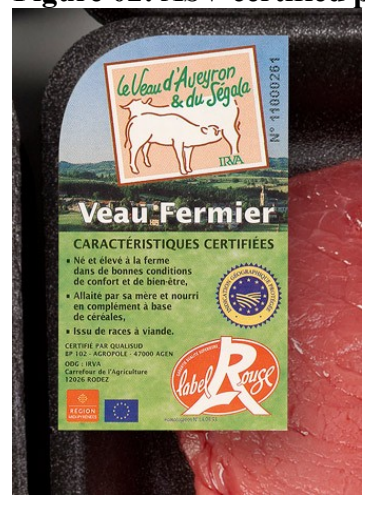
Figure 02: ASV certified products