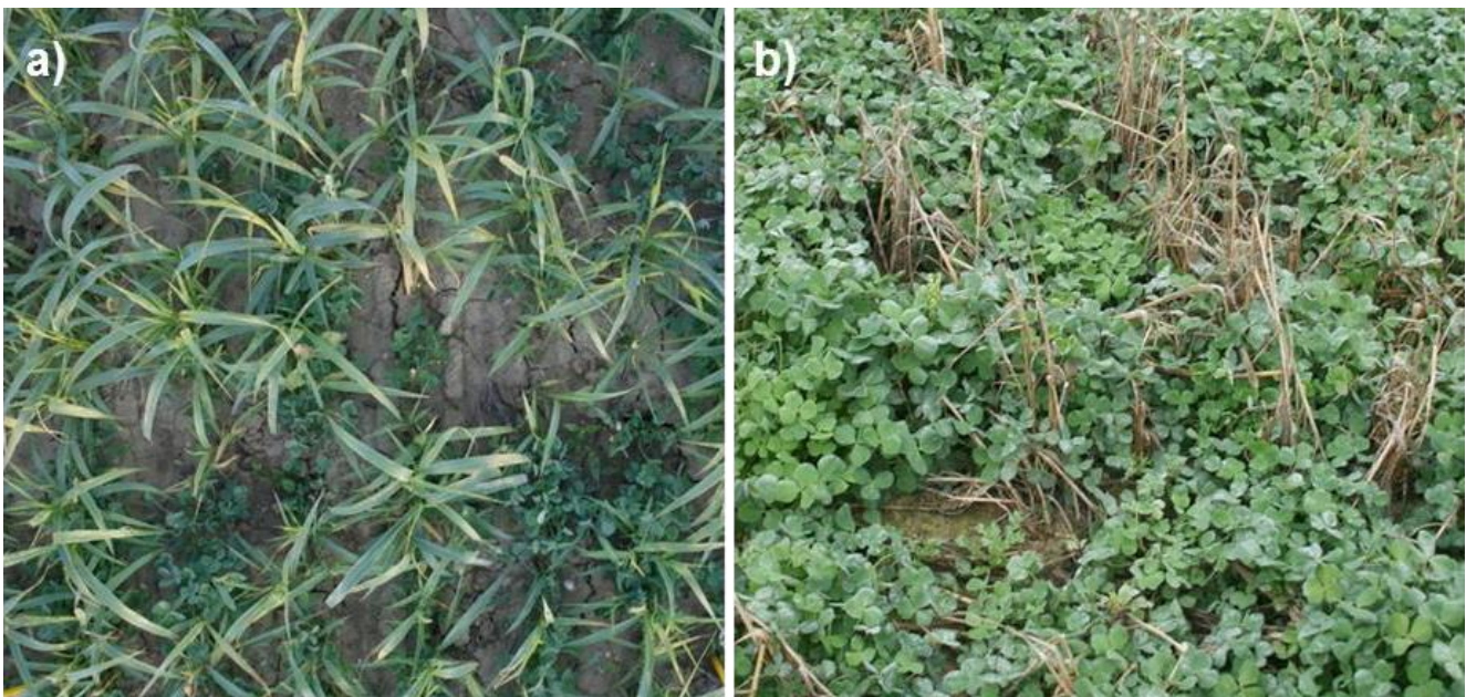
Figure 2: Example of the evolution of the moha-clover mixture to provide "relay" ecosystem services through early moha development and then maintenance of winter cover with frost-resistant clover. Photographs taken: a) 4 th October 2012 and b) 8 th January 2013.

In the case of a long fallow period with termination at the beginning of spring , it is desirable to provide both nitrogen management services while maintaining a vegetative soil cover to avoid soil erosion or structure degradation. In this case, species must be resistant to winter conditions (low senescence and/or good frost tolerance), i.e. a mixture of ryegrass-red clover can be chosen. One may also want to have a succession of these N services thanks to a temporal complementarity for access to resources, starting with an efficient "nitrate catching" effect at the beginning of the cycle followed by a "green manuring" effect in a second stage. In this case, a mixture associating a non-legume plant with early development in autumn can be sown to enhance the nitrate catching very early