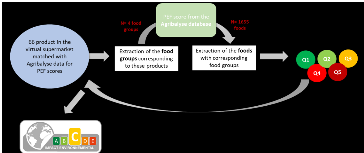
Figure 2. Creation of an environmental score for the label