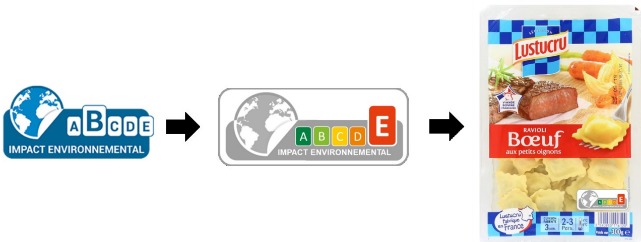
Figure 3. Design of the environmental label inspired by the French environmental label of ADEME

In September 2020, the French Agency for ecological transition (ADEME) published a design for a label assessing the environmental impact for the life cycle analysis of products or services (ADEME, 2020), see Figure 3 . The colour was changed to obtain a “traffic light label” since it is considered as the best option to increase understanding and therefore behaviour change in consumers, see Figure 3 . The label will be placed on the bottom part of the products.