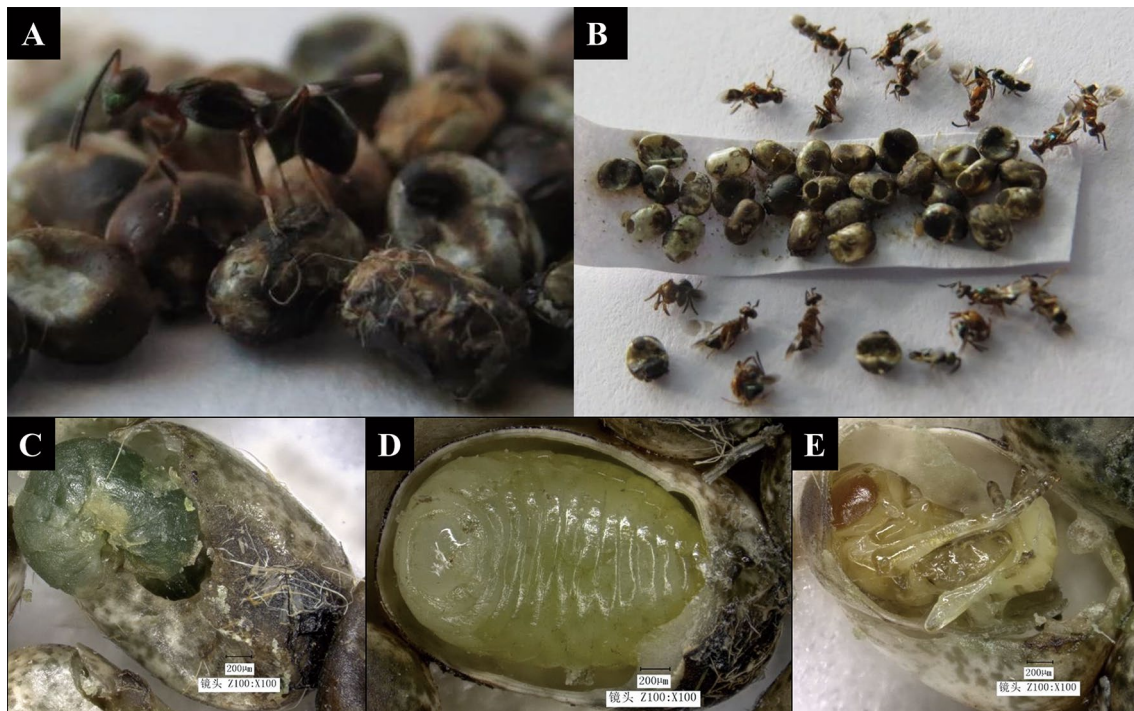
Fig. 2 Images of an adult female parasitizing C. japonica egg (a), emerged adults (b), dead larva (c), and alive (in diapause) pre-pupa (d) and pupa (e) of A. japonicus

the dissections. Thus, offspring survival could be slightly overestimated. Given the overall low percentages of dead host eggs across all parasitoid species and host age treatments (<10%), any differences resulting from the overestimation could be negligible.