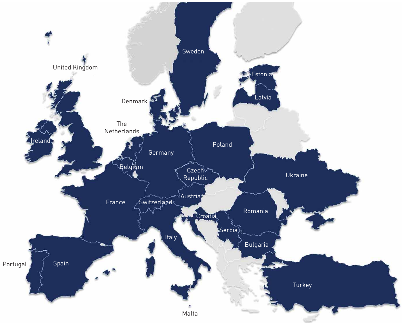
FIGURE 1 European countries in which study centres are located.

For patients who are lost to follow-up ( i.e. those patients whose status is unclear because they fail to appear for study visits without stating an intention to withdraw), the investigator should show “due diligence” (if allowed by national ethics committee standards) by documenting in the source documents steps taken to contact the patient, e.g. dates of telephone calls, registered letters, etc.