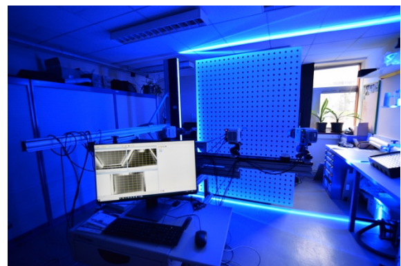
Figure 1 Air purifier flow measurement: a) Schematic view of one stereo measurement for upstream flow field; b) Calibration setup test.