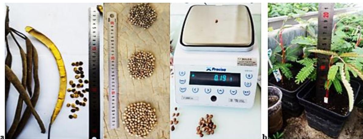
Fig. 1 Images of hulling, sorting of healthy seeds and measurement of the dimensions of each seed (a) and then of three-month-old seedlings in the greenhouse.