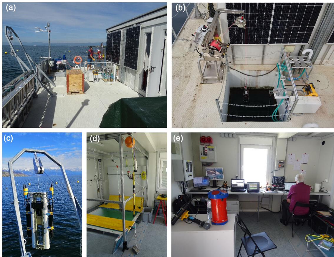
FIGURE 2 LéXPLORE elements (from top left to bottom right): (a) outdoor work area, (b) outdoor moonpool with electric crane (left) and pump system (right), (c) Wirewalker deployment using an A-frame, (d) partially covered indoor moonpool, and (e) office work area

contribute to uncertainties in piston velocities including (a) lateral and temporal variability of wind forcing, (b) interactions of wind-induced and cooling-induced turbulence, and (c) fluctuations in surface wave-affected gas transfer (Deike & Melville, 2018; Reichl & Deike, 2020). In addition, the scale of vertical and temporal variations in gas concentrations in the upper few tens of centimeters of the water column (Watson et al., 2020) and sub-daily variation in near-surface stratification and gas transfer velocity from intermittent wind, waves, and heat fluxes can obscure detection of forces driving gas transfer. These dynamics demonstrate that both concentration gradients (driving force) and turbulence levels (transfer velocity) vary considerably over short time scales of less than a day. Gas fluxes represent the instantaneous product of these processes and thus vary on the same time scales.