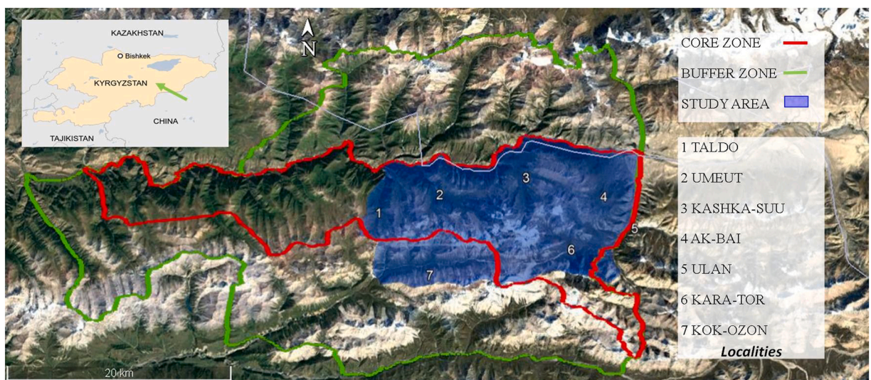
Fig. 1. Map of the study area in and around Naryn State Nature Reserve; Numbers on the map are referring to localities insert in the right bottom corner.

They registered fauna on the spot, all year long, except if unintentional triggers saturated the SD card and exhausted batteries or if the camera was damaged by fauna. The camera traps were checked at least once every summer, sometimes more often.