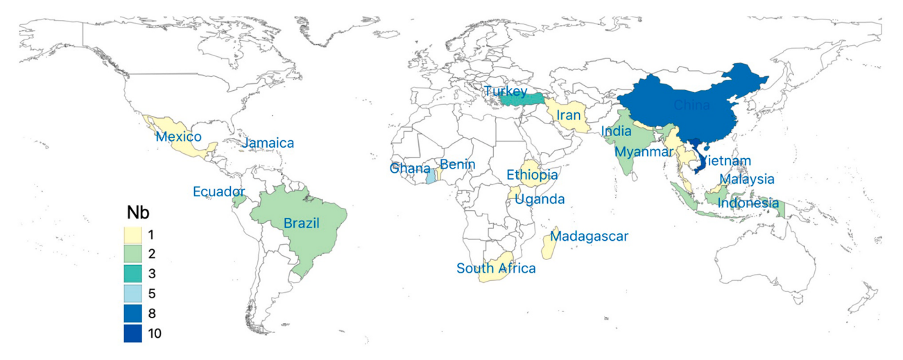
Fig. 3. Here Map showing density of food safety research*Footnote Nb = number of studies conducted in each country.

reducing risk and improving safety (Behrens et al., 2010; Figuié, 2003; Ha et al., 2020; Kendall et al., 2019; Pham and Turner, 2020; Stanton, 2019; Wertheim-Heck et al., 2014, 2015). One consumer highlighted this importance: "Some months ago, I moved to this area. Before I had my regular vendor, but also here I searched for a good vendor and was lucky to find my new vendor. She advises me on what is safe and fresh to buy" [Adult, Vietnam] (Wertheim-Heck et al., 2015). Purchasing animal sourced products from trusted butchers was also a strategy used to ensure food safety (Kendall, 2018; Zorba and Kaptan, 2011).