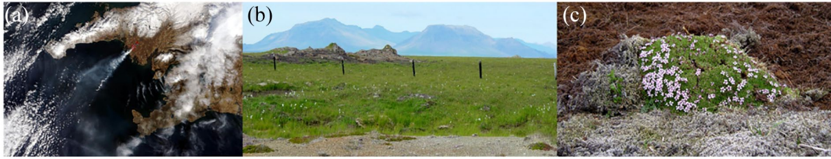
Figure 2. (a) The Myrar wildland fire on 30 March 2006 at 12:55, (b) Myrar 24 July 2006, and (c) edge of a moss fire in June 2007.

lowland coniferous plantations, fire damage can be significant (Szatmári et al., 2016). Human-induced fire, which is generally ignited unintentionally, is the major cause of wildland fires. Arson, for example, affects approximately 10 000 ha of grassland per year (Deak et al., 2014). Prescribed burning is scarcely applied due to legislative constraints, even though in grasslands it may present a feasible solution for several conservation challenges, for example, for increasing landscape-scale diversity, creating habitats for specialist species or for decreasing the amount of accumulated litter (Deak et al., 2014) and also for the protection of the endangered great bustard (Végvári et al., 2016).