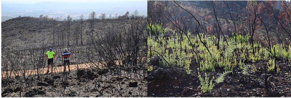
Figure 5. Wildland fires induce a sudden removal of the plant cover, but soon plant cover recovers and changes in plant composition as a consequence of the fire takes place. Carcaixent, Eastern Iberian Peninsula. To the left June 22, 2016, to the right September 8, 2016.

having larger, more intense, and severe wildland fires (San-Miguel-Ayanz, Moreno, & Camia, 2013; Figure 5).