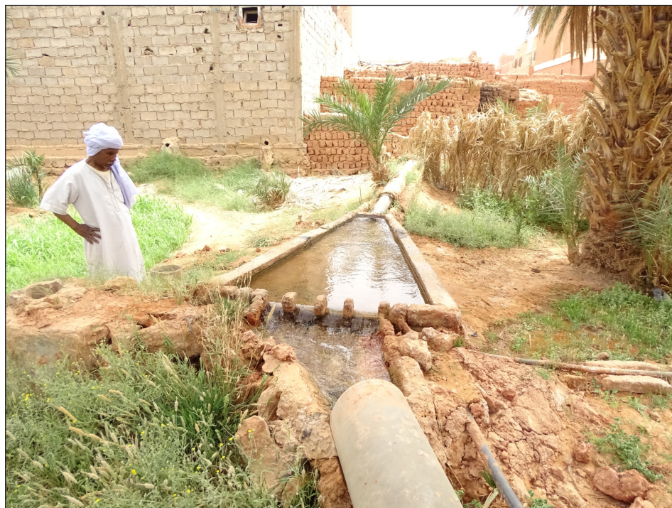
Picture 3 Replacing traditional channels by modern pipes while keeping the use of the water sharing basin ( kesria ) to ensure the visibility of water distribution for all. On the picture, the channel upstream of the kesria (top of the picture) has been replaced by a concrete pipe carrying all of the discharge of the foggara. In the kesria , part of the foggara discharge is diverted to smaller pipes that go left and right on the picture. What is remaining is the combined discharge of several water owners that will be transported in the big concrete pipe further downstream, where there is another kesria to sub-divide between these owners. (April 2017).

Our findings challenge the hypothesis of a general decline of foggaras in the Touat, Gourara and Tidikelt oases. Peasants continue working in traditional oases while adapting the foggara to recent transformations, thus revitalizing oasis agriculture (Hadeid et al., 2018). There is even a remarkable return of peasants to foggara and