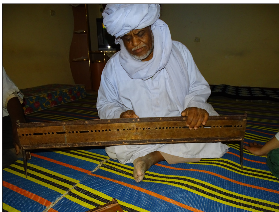
Picture 2 The flow measurement device ( louh ) is used by the water master to check the water shares of different water owners of particular foggaras (April 2017).

The fact there are no water turns in foggaras reduces the need for monitoring of water sharing, which is the fourth design principle. The only part of the foggara that requires