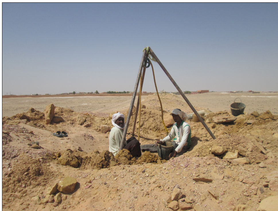
Picture 1 Two young men (one inside the well, not visible in the photo), accompanied by an elder, on duty maintaining a well (August 2016).

Similar tensions between different social categories can be observed in other oases. In Brinken oasis ( Table 1 ), located northwest of the city of Adrar, a dozen foggaras are still working, even though sharecroppers still do not have any water shares. Some of the sharecroppers dug wells upstream of the oasis close to foggaras, but they were never able to exploit them because the foggara owners objected. Today, the descendants of foggara owners do the maintenance themselves, and continue to exclude former sharecroppers from access to foggara water. In many cases, including the oases of Tsabit and Badriane ( Table 1 ), the social conflicts are still waiting for court decisions.