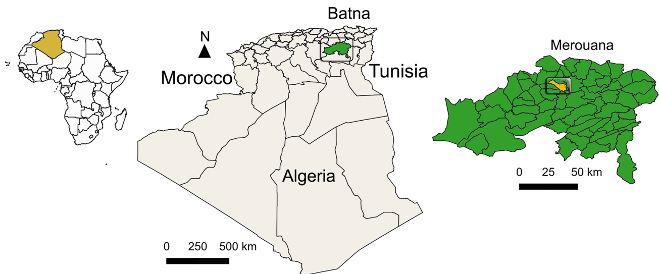
Fig. 1 Geographical location of Merouana District, Batna Province, Algeria

composed by native or crossbred cows ( n = 56 ) and imported or exotic European purebred cows ( n = 44 ; 23 Holstein and 21 Fleckvieh). The study cows were composed of 37 primiparous and 63 multiparous. The lactation number ranged from one to 10. All herds were overall composed by less than 50 cows without calving concentration strategy (the calving occurring throughout the year). During lactation, cows were milked mechanically and have their concentrate portions, twice a day.