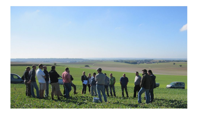
Fig. 6 The in-depth transformation of agricultural practices, necessary for the success of zero-pesticide systems, is enriched by (1) collective design processes that rely on exchanges between practitioners and researchers and promote the exploration of innovative solutions, and by (2) the confrontation of the solutions imagined to real situations of implementation (agricultural plots). Here, a group of farmers, advisers, and researchers observe the results of new practices implemented in the fields (the management of cover crops).

Paying farmers for pesticide-free practices Beyond the effectiveness of current policies, more ambitious policies to eliminate pesticides must be developed, in particular by paying farmers who use pesticide-free practices. Indeed, the expected redesign and innovations described previously may not be effective immediately after they are implemented: crop yields may decrease due to the removal of pesticides and costs may increase, in particular labor costs. This phenomenon could be temporary, lasting only during a transition period during which natural regulations are not yet established, or more permanent. Payment should thus be