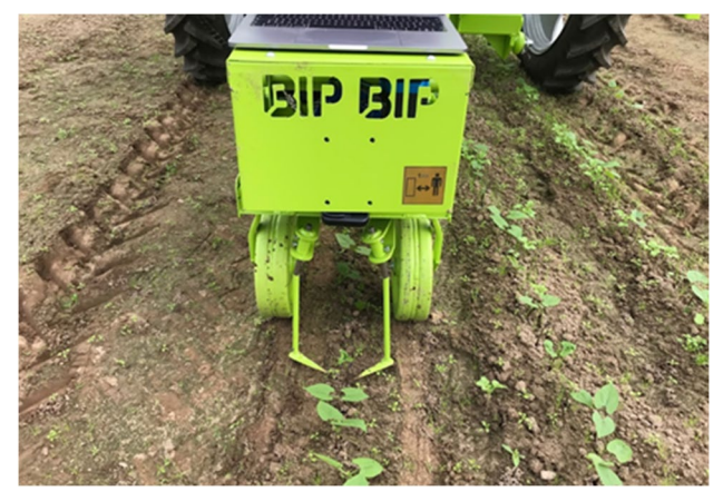
Fig. 5 The ability to control weed management in the row is a key lever for implementing herbicide-free practices. Machines providing physical weeding in the rows are starting to be offered by various manufacturers. Here, the task is carried out by the BIP BIP robot that combines three fundamental functionalities: observation of the row with a camera, analysis of the situation with on-board algorithms, and carrying out an appropriate action (i.e., mechanical weeding with great efficiency and without harming the crop). Photograph of prototype 5 of the BIPBIP system designed for intra-row mechanical weeding of vegetable crops, taken by Louis Lac for the BIPBIP-project, funded by the French National Research Agency).

in order to facilitate processing of grain harvested from intercrops (Meynard et al. 2018). This is also relevant when crops are interlocked on the same field (e.g., living mulch) without being intended for harvest (Wortman et al. 2012). Overall, the equipment of these innovations must cover the needs of main crops and diversified crops at low cost.