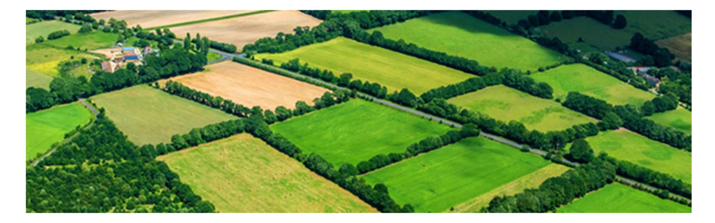
Fig. 2 Pesticide-free agriculture cannot be conceived without managing the spatial heterogeneity of landscapes: the design of mosaics of cropping systems, in interaction with semi-natural habitats, is essen-