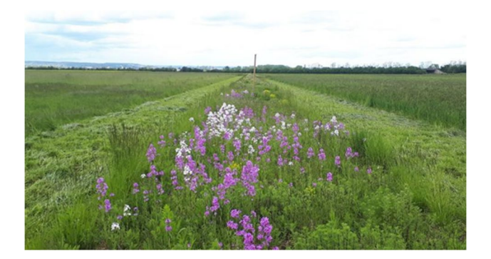
Fig. 1 Introducing flowerbeds at the edge of the field makes it possible to reproduce semi-natural habitats that are rich in plant biodiversity and offer habitat and trophic resources to the auxiliaries; this during a large part of the year, especially during periods when there is no more culture in place. By keeping the auxiliaries in these strips, farmers enable them to more easily play their role of natural pest control in neighboring plots, provided that the practices on these plots be well thought out.

without pesticides, and (3) propose scientific challenges that enhance synergies between these fronts. Throughout this article, we use "pesticide" to refer to "chemical pesticides," defined as synthetic or natural pesticides that have a negative impact on the environment and human health (including some products used in organic production or for biocontrol).