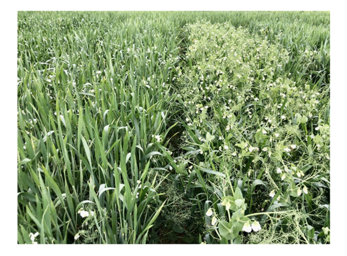
Fig. 4 Intercropping enhances plant diversity in order to limit yield losses due to pests. This diversification scheme requires species and varieties adapted to coexist and to interact with the environment. The various stages of plant breeding and selection must therefore account for new criteria to optimize the adaptation and interaction capacities of plants with their biotic environment. The expected benefits are a better resistance and a great associated diversity to regulate the feedback loops between the soil and the plant diversity (REMIX project, INRAE (2021)).

breeding programs to capture benefits of genetic diversity (Gaudio et al. 2019). Some European programs as DIVER-SIFY or REMIX on cropped species (refer also to the European initiative "Crop Diversification Cluster") pointed out some results that support this assertion (Annicchiarico et al. 2019; Jäck et al. 2021). Genetic diversity could indeed promote species diversity in plant communities (Prieto et al. 2015; Meilhac et al. 2019), through genetic and ecological mechanisms (Meilhac et al. 2020). Thus, increasing diversity requires considering jointly multiple levels of biodiversity (i.e., genes, population, or community). To date, breeding programs have had difficulty deriving value from the benefits of inter- or intra-crop mixtures due to the few traits that they consider (Litrico and Violle 2015). In contrast, breeding programs have aimed for the standardization required by the food supply chain.