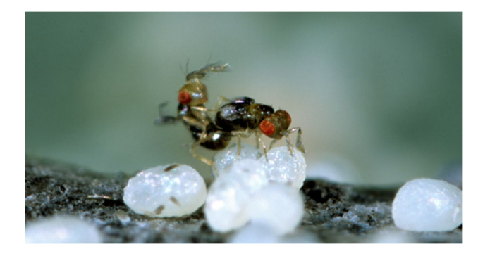
Fig.3 The use of Trichogramma micro-wasps against lepidopteran pests has been an undeniable biocontrol success story for several decades. Despite this success, this example also illustrates the kind of biocontrol challenges that can be facilitated in a pesticide-free system perspective. The use of biocontrol strategies could be drastically increased (it is currently limited to 10–20% of potential target areas), diversified in terms of target crops, and based not only on massive inondative releases but also on inoculations followed by long-term management of populations. These evolutions can be fostered by the development of new business models, which deviate from the current strategies conceived for massively used pesticides.

niche markets with no current control solution). Analyzing the issues that pests cause in pesticide-free cropping systems while identifying biocontrol solutions adapted to each issue should become a research and innovation activity in itself. It should be based on analyzing (1) pest control issues in a variety of cropping systems and associated agri-food chains with high environmental, economic, and social sustainability (and representative of systems that will become widely used in the future); (2) factors that influence the severity of these pest issues in these systems; and (3) the fit of potential types of biocontrol strategies (e.g., classical, conservation) with the target pest issue, cropping system, and agri-food chain. Doing so would comprehensively identify needs of each type of agri-food chain and geographic area, and would provide insights into the expected role and technical and economic characteristics of potentially relevant biocontrol strategies. This will enable research and innovation investment strategies and market analysis methods to be adjusted for both public and private stakeholders.