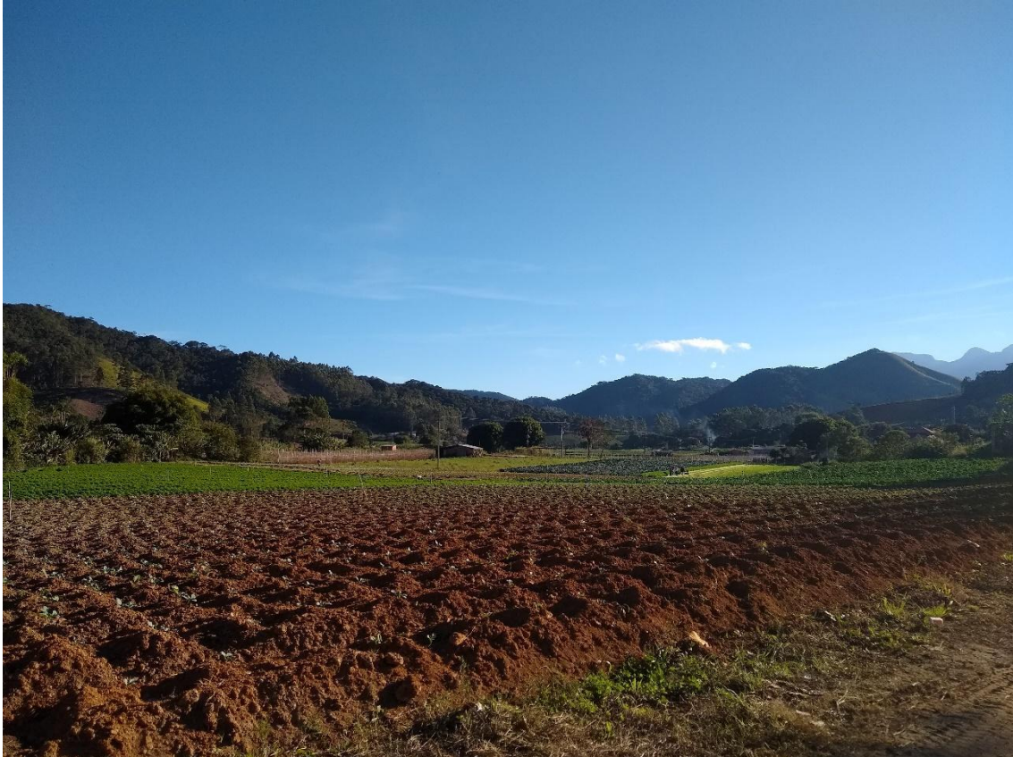
Figure 3 - Community of São Lourenço – Third District of Nova Friburgo