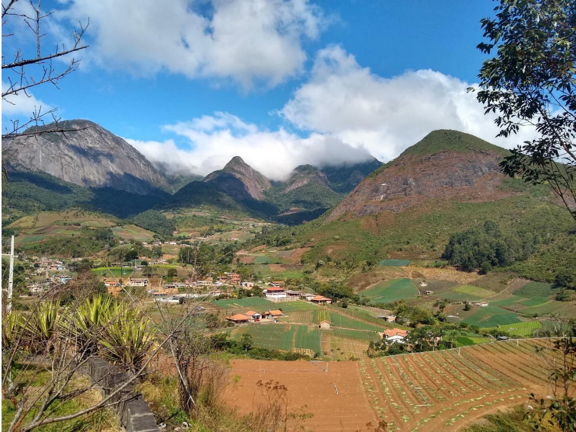
Figure 2 - Rural community Vieira – Teresópolis-RJ