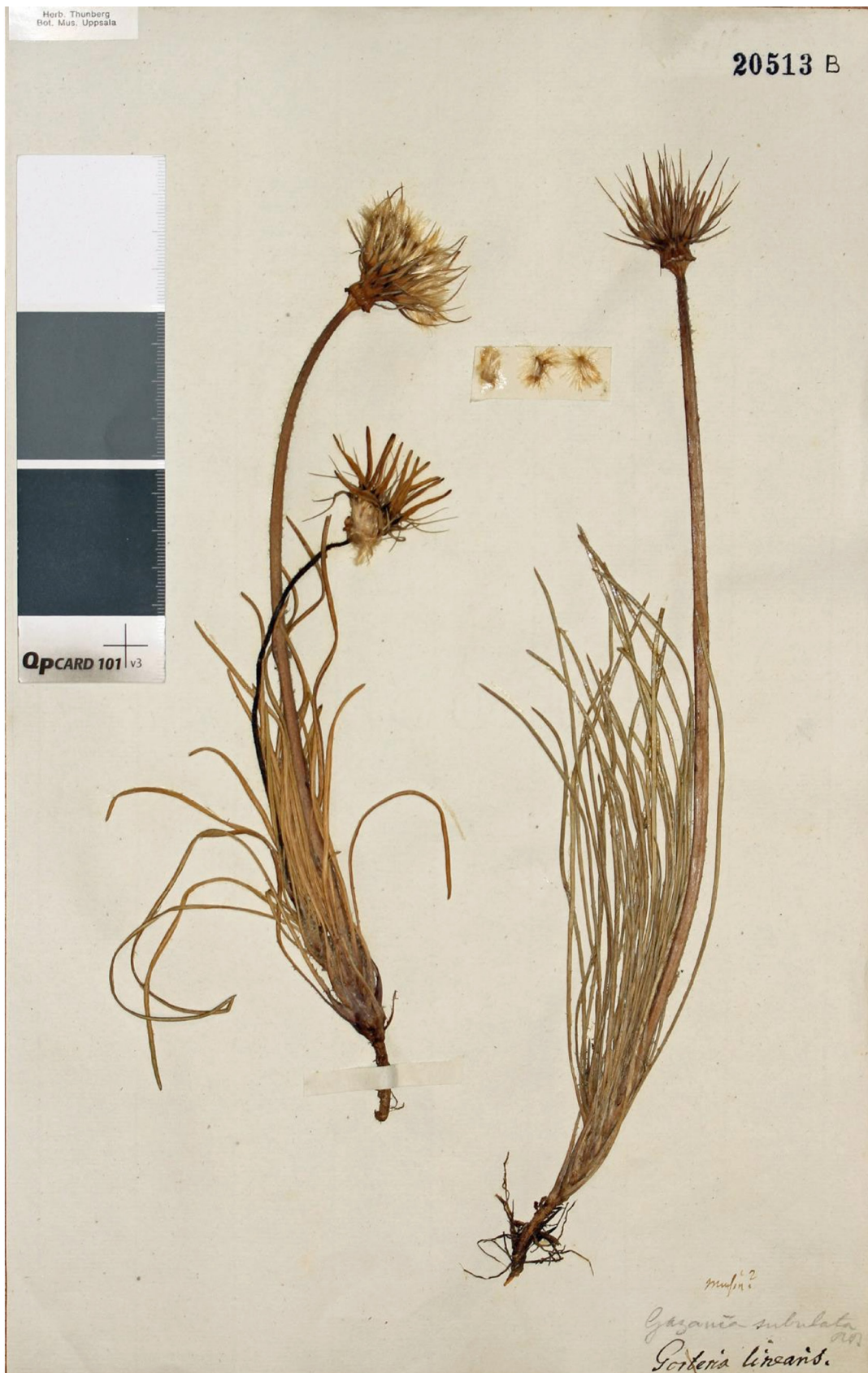
Figure 3. Lectotype of Gorteria linearis (designated here). Origin: South Africa, Cape Province, e Cap. b. spei (Thunberg's handwriting), Thunberg s.n. (UPS-THUNB20513B, 2020).

Distribution and habitat. The genus Guizotia Cass. (Heliantheae Cass.) consists of six species, five of them are native to the Ethiopian highlands in tropical Africa (Baagøe, 1974; Bekele et al. , 2007). Guizotia abyssinica is a species native to East Africa that occurs in Ethiopia