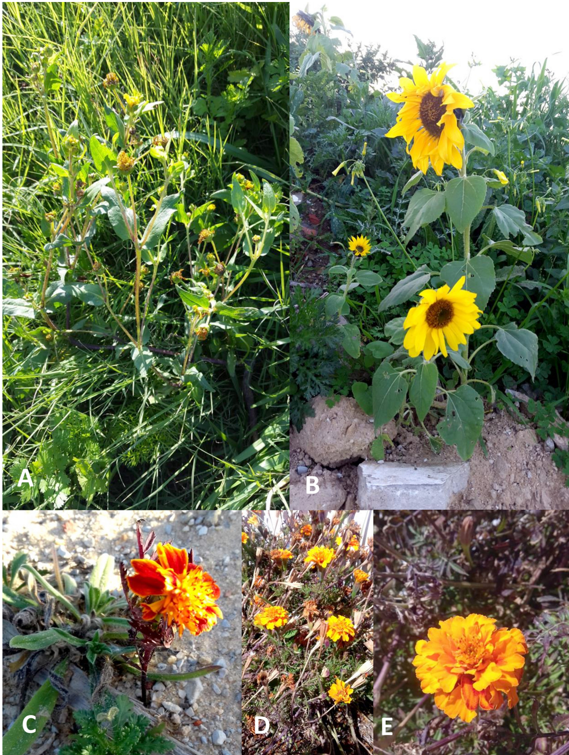
Figure 4. A, Guizotia abyssinica as a casual alien in the centre-east of Tunisia; B, Helianthus annuus as casual weed within disturbed areas in the north-east of Tunisia; C–E, Tagetes erecta in different ruderal habitats in the centre-east of Tunisia.

Examined specimen. Tunisia, Jendouba (Fernana, NW Tunisia), within an abandoned house, WGS84 36° 39'03"N, 8°41'50"E, 265 m asl, 3 October 2006, R. El Mokni s.n. (Herb. El Mokni! Fac. Sc. Bizerta).