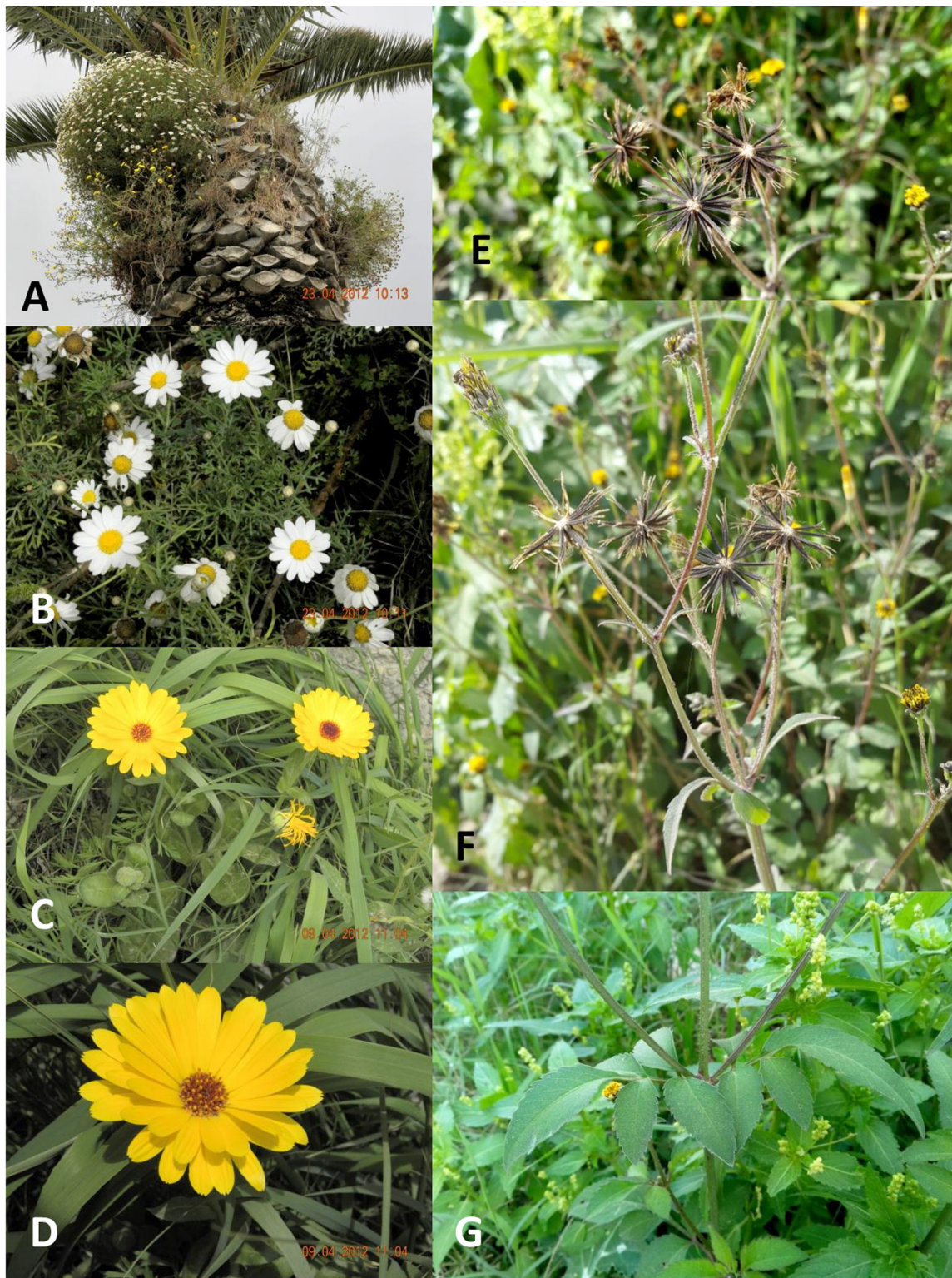
Figure 1. A–B, Argyranthemum frutescens subsp. frutescens as an epiphytic weed on palm tree in the north-eastern of Tunisia; A, habit and habitat; B, capitula in bloom; C–D, Calendula officinalis as casual weed on the centre-eastern coast of Tunisia within a stream water; C, habit and habitat; D, capitulum in bloom; E–G, Bidens pilosa on roadsides in the centre-east of Tunisia; E, cypselae; F, habit of the plant during fruiting period, G, cauline leaves.

Artemisia absinthium L., Sp. Pl. 2: 848. 1753.