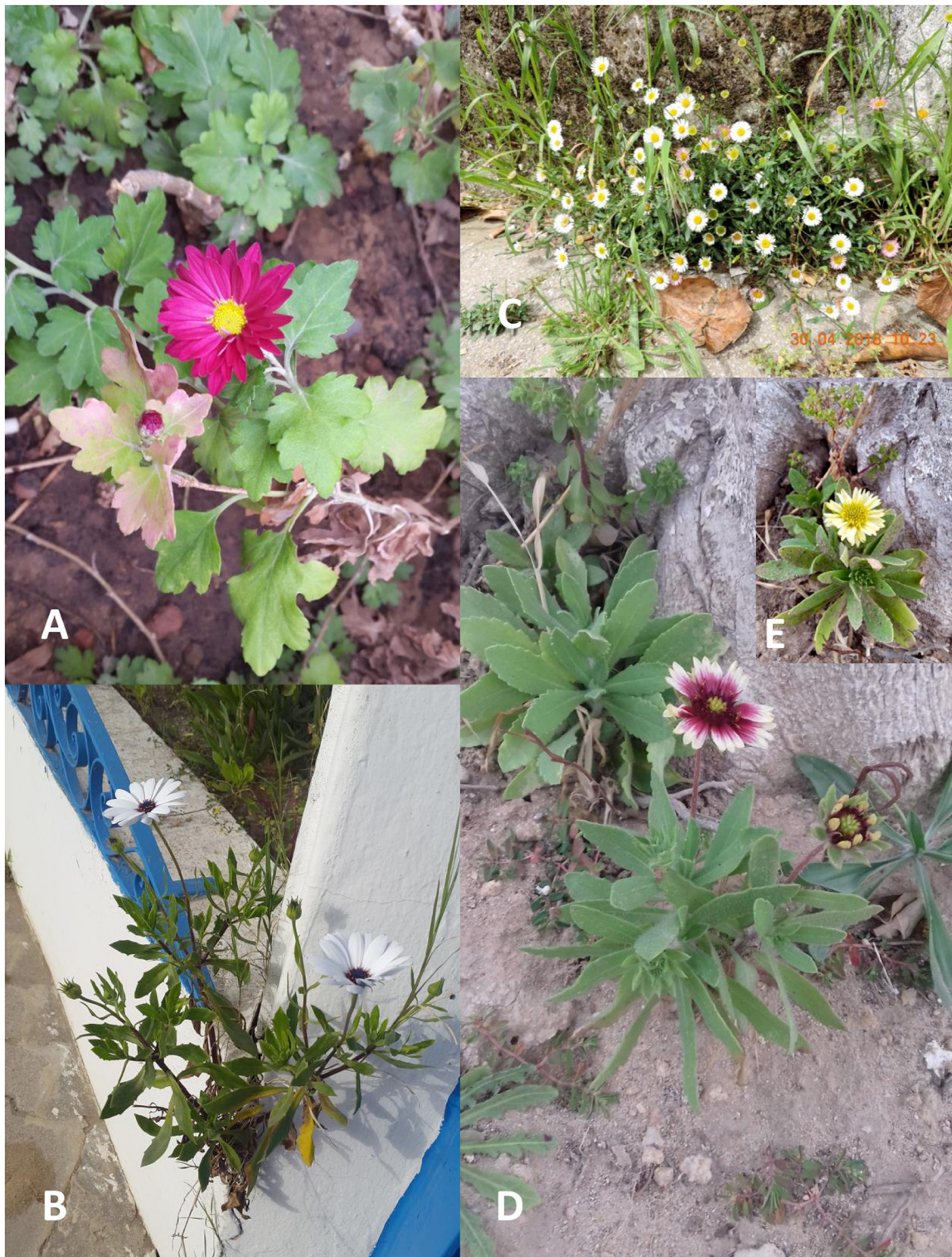
Figure 2. A, Chrysanthemum morifolium as ruderal in the centre-east of Tunisia; B, Dimorphotheca ecklonis as casual weed on rips of a wall in the centre-eastern coast of Tunisia; C, Erigeron karvinskianus flowering individuals on the ancient walls in the north-western of Tunisia; D–E, Gaillardia ×grandiflor within roadsides in the centre-east of Tunisia.

Examined specimens. Tunisia, Monastir (roadsides from Khénis to Monastir city, CE Tunisia), WGS84 35° 43'47.84"N, 10°49'10.38"E, 2 m asl, 9 April 2012, R. El Mokni & Errol Vêla s.n. (Herb. Univ. Monastir!); Monastir (Jemmel, CE Tunisia), WGS84 35° 37'28.36"N, 10°45'30.47"E, 32–33 m asl, 17 April 2015, R. El Mokni s.n. (Herb. Univ. Monastir!); Jendouba (Tabarka, NW Tunisia), WGS84 36° 56'03.74"N, 8°47'32.33"E, 15 m asl, 3 May 2014,