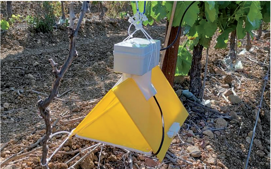
Connected insect trap.

The scientific and technological knowledge that will support the transition towards new systems of production (including organic farming, integrated pest management and agroforestry) are still being developed. But in order to ensure the widespread deployment of agroecological models and to enable them to be scaled up, there is an urgent need to understand the mechanisms involved ( Altieri et al., 2012 ) and to establish points of reference ( Vanloqueren and Baret, 2009 ). In agroecology, all levels of diversity and biological regulation – within species, between species or functional (plant-animal interaction, landscape ecology, etc.) – can be deployed in order to make systems resilient ( Caquet et al., 2020 ). The flipside is the abundance of possibilities – of varieties to choose, species assemblages, interaction between crops and livestock – which makes it impossible to create knowledge out following conventional paths. Faced with this challenge, new modes of building knowledge must be developed, and digital technology can contribute to this vital step for the agroecological transition ( Leveau et al., 2019 ) using three interconnected levers: (i) the modelling of agroecological complex systems, which requires a holistic approach; (ii) data collection on these new cropping growing and breeding methods, chiefly through the participatory collection of information; (iii) the inference of models on these new production systems, based on data.