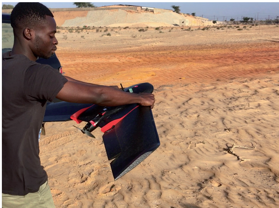
Takeoff of a mapping drone in Senegal.

The principles of precision livestock farming and precision agriculture can be applied to agroecology since they lead to interventions tailored to suit plants and animals needs. They centre around a four-stage: observation (measuring “symptoms”), diagnosis (identifying the status of a plant or an animal), recommendation (determining the action to take), and action. With precision agriculture it is possible to map diversity within crops and to apply different measures to different parts of a plot (Bellon and Huyghe, 2016): nitrogen fertilisation (using satellite sensors from the early 2000s onwards and now tractor-