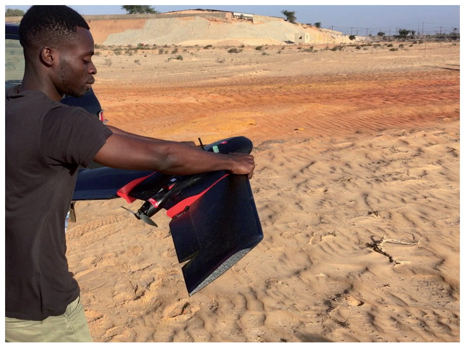
Takeoff of a mapping drone in Senegal.

The principles of precision livestock farming and precision agriculture can be applied to agroecology since they lead to interventions tailored to suit plants and animals needs. They centre around a four-stage: observation (measuring "symptoms"), diagnosis (identifying the status of a plant or an animal), recommendation (determining the action to take), and action. With precision agriculture it is possible to map diversity within crops and to apply different measures to different parts of a plot ( Bellon and Huyghe , 2016): nitrogen fertilisation (using satellite sensors from the early 2000s onwards and now tractor-