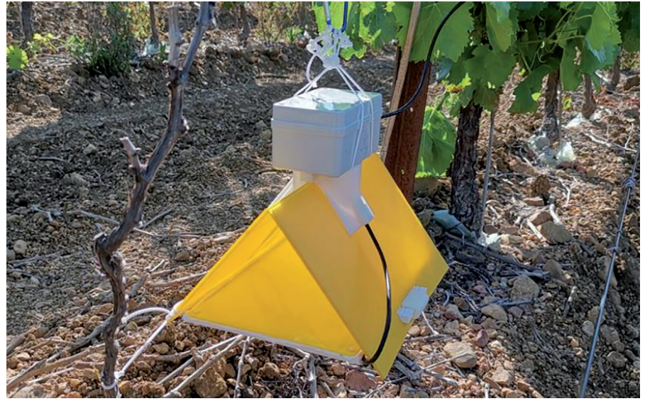
Connected insect trap.

The scientific and technological knowledge that will support the transition towards new systems of production (including organic farming, integrated pest management and agroforestry) are still being developed. But in order to ensure the widespread deployment of agroecological models and to enable them to be scaled up, there is an urgent need to understand the mechanisms involved (Altieri et al., 2012) and to establish points of reference (Vanlogueren and Baret, 2009). In agroecology, all levels of diversity and biological regulation - within species, between species or functional (plant-animal interaction, landscape ecology, etc.) can be deployed in order to make systems resilient ( Caquet et al. , 2020). The flipside is the abundance of possibilities - of varieties to choose, species assemblages, interaction between crops and livestock - which makes it impossible to create knowledge out following conventional paths. Faced with this challenge, new modes of building knowledge must be developed, and digital technology can contribute to this vital step for the agroecological transition (Leveau et al., 2019) using three interconnected levers: (i) the modelling of agroecological complex systems, which requires a holistic approach; (ii) data collection on these new cropping growing and breeding methods, chiefly through the participatory collection of information; (iii) the inference of models on these new production systems, based on data.