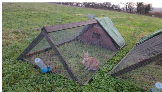
Figure 1: Movable cages on pasture for organic rabbit farming

The development of organic production is growing significantly since 2009. However, organic rabbit farming (ORF) remains a niche market in France (about 50 farms), and the consumer demand exceeds the supply (Roinsard et al. , 2016). ORF French specifications contain several rules and recommendations, such as whole year grazing, natural breeding, and slaughter after 100 days of age, housing in movable cages ( Figure 1 ) or in paddocks, and use of breeds adapted to grazing and adapted to outdoor management. In indoor conventional rabbit farming, the breeding performance is