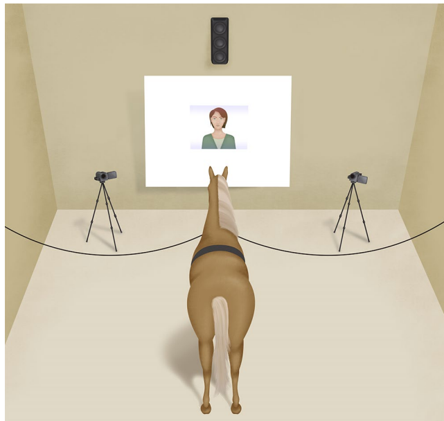
Figure 2. Schematic representation of the experimental setup.

Habituation. The horse was led to the middle of the stall facing the screen. Two loose ropes were attached, the assistant took his place, and the habituation phase began. Scenes of nature accompanied by bird songs were projected while the assistant monitored the horse's heart rate on the Polar watch. In this phase, the assistant could reposition the horse if it was facing the door opposite the screen. Once the horse was calm (not neighing, pulling on the ropes with his head, nor trying to turn around or leave) and its heart rate had remained below 100 bpm for two consecutive minutes, the test phase began immediately. If this criterion was not met after five minutes, the session ended, and a new session was scheduled for the following day.