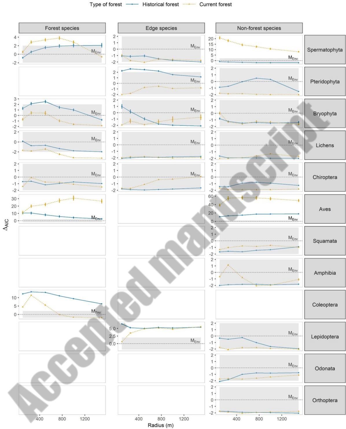
Figure 1: Differences in AIC between models M_{Act} or M_{Hist} and M_{Env} for each taxonomic group and type of threatened species (forest, edge or non-forest). \Delta_{AIC} between -2 and +2 (shaded area) means there is no statistical difference between models M_{Act} or M_{Hist} and M_{Env} . Error bars represent standard deviation between the 20 iterations. The higher the \Delta_{AIC} , the more explanatory the model. Empty boxes = non-applicable model.