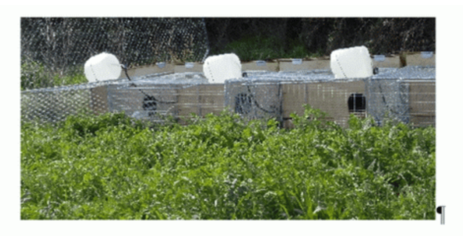
Figure \cdot 1 \cdot - \cdot Mobile \cdot cages \cdot on \cdot sainfoin \cdot plot \cdot (Spring \cdot 2016) \P