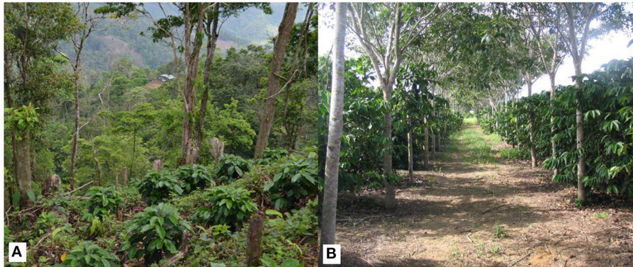
FIGURE 1 | Different ways of cultivating coffee under shade. (A) Terraced Arabica coffee on an elevated site in amongst a mixture of trees species. (B) Experimental trial with C. canephora (Conilon cv.) in an agroforestry system intercropped with a single shade tree species.