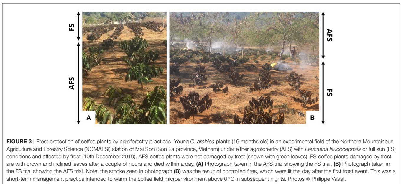
FIGURE 3 | Frost protection of coffee plants by agroforestry practices. Young C. arabica plants (16 months old) in an experimental field of the Northern Mountainous Agriculture and Forestry Science (NOMAFSI) station of Mai Son (Son La province, Vietnam) under either agroforestry (AFS) with Leucaena leucocephala or full sun (FS) conditions and affected by frost (10th December 2019). AFS coffee plants were not damaged by frost (shown with green leaves). FS coffee plants damaged by frost are with brown and inclined leaves after a couple of hours and died within a day. (A) Photograph taken in the AFS trial showing the FS trial. (B) Photograph taken in the FS trial showing the AFS trial. Note: the smoke seen in photograph (B) was the result of controlled fires, which were lit the day after the first frost event. This was a short-term management practice intended to warm the coffee field microenvironment above 0 °C in subsequent nights.

*However the combined transpiration of shade trees and coffee plants contributed a larger overall eco-system transpiration, thus reducing the overall water availability compared to full sun conditions (van Kanten and Vaast, 2006).