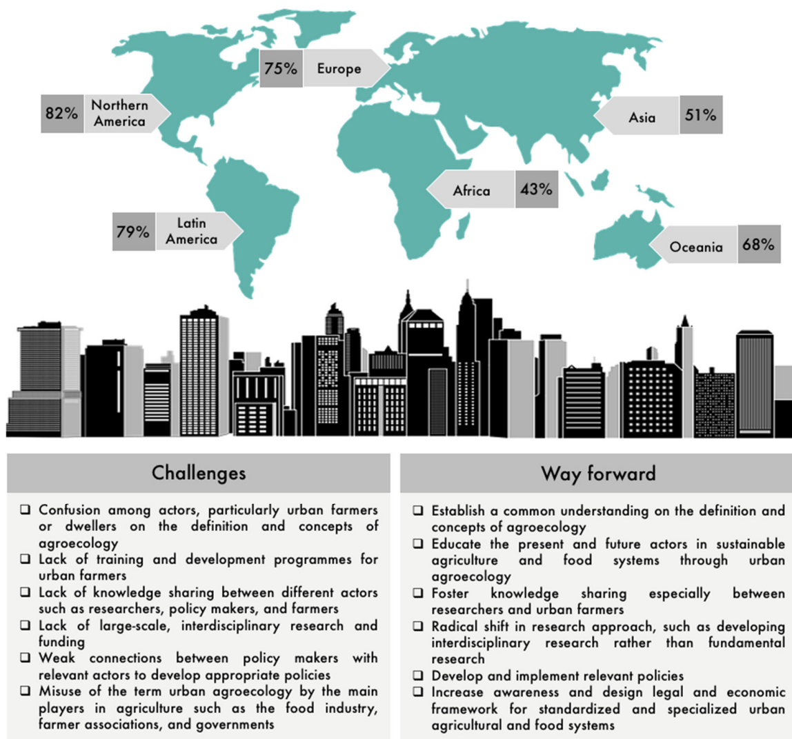
Figure 3. The underlying challenges and considerations of implementing urban agroecology.

nowadays prefer a more diverse food basket by incorporating some minor grains (such as quinoa and millets) into their diet, resulting in lower consumption of some major cereals (such as maize and rice) [16,48]. This begs the question of how the urban world can double food availability based on varying demand while minimizing the environmental impact of agriculture. In recent years, the long-running debate over the best approach to addressing global food challenges has become more polarized, particularly when conventional and sustainable agriculture are factored in [49,50]. Perhaps the most realistic approach is a combination of the best of both as it sounds unrealistic to totally stop using chemical inputs and take them over with organic fertilizers or pesticides. Transformative social-ecological approaches are required to sustain the rapid growth of urban populations on all continents except Antarctica (Figure 3).