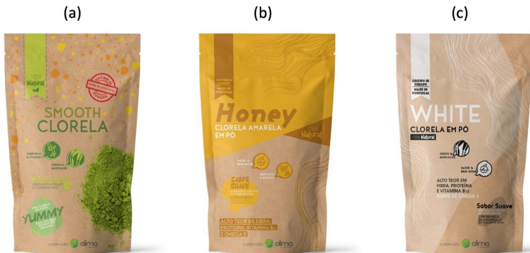
Figure 1. Commercial Chlorella produced by the Portuguese company Allmicroalgae: (a) lime, (b) yellow, and (c) white.

An important factor to consider in the application of microalgae biomass for food is the digestibility, as the robust cell wall of certain strains can restrict the access of the digestive enzymes to the cell components [105]. Niccolai et al. [106] investigated the digestibility of 12 microalgae using pepsin and pancreatin as enzymes. The authors found the highest digestibility for cyanobacteria, mainly A. platensis F&E-C256 (78% dry matter, 86% organic matter, 79% carbohydrate, and 82% crude protein digestibility), Chlorella sorokiniana F&E-M-M49 and C. vulgaris Allma. Marine species, such as Tetraselmis suecica , Phaeodactylum tricornutum , Nannochloropsis sp., and Porphyridium purpureum , were the least digestible [106]. This is probably due to different cell wall structures. Nannochloropsis has a thick cell wall composed of cellulose and algaenans that may reduce digestibility. Porphyridium cells are covered by polysaccharides that can form stable complexes with proteins and reduce cell access to proteolytic enzymes. On the other hand, green algae such as T. suecica have a cell wall composed of cellulose, hemicellulose, pectic compounds, and glycoproteins that can interfere with the action of digestive enzymes. Additional treatments on microalgal biomass could be performed for increasing protein digestibility.