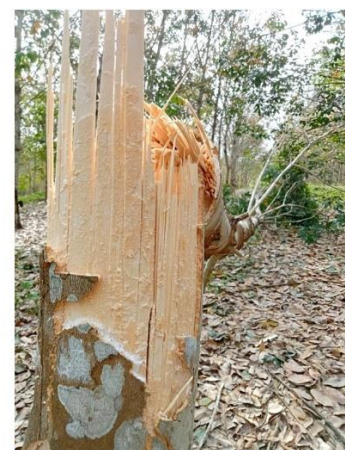
Figure 2: Trunk breakage of a 6-year-old rubber tree after bending test.