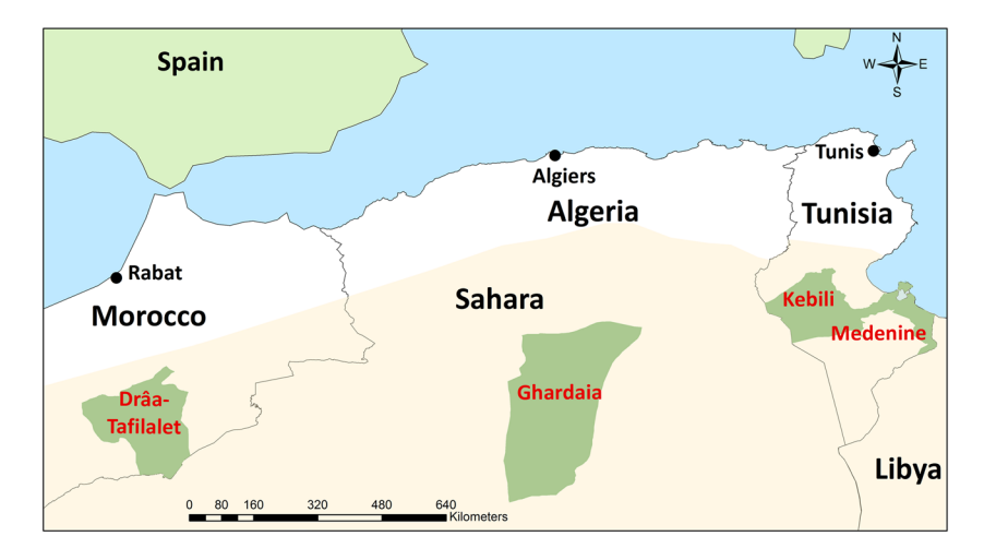
FIGURE 1 The three study areas [Colour figure can be viewed at wileyonlinelibrary.com]

Our analysis of changes in LDOs considered two dimensions. The first is the organisations' fields of action: those defined at their creation and those defined later on. We analysed activities that provide direct services or support to