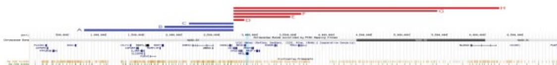
Figure 2: CMA results, using male (A/B, E/F and G/H) or female (C/D) DNA references.

Figure 1: X chromosome rearrangements with the location of ARSE in light blue. A to C: the blue line corresponds to partial duplication. D to H: the red line corresponds to partial deletion. Specific breakpoint locations are given in Table 1.