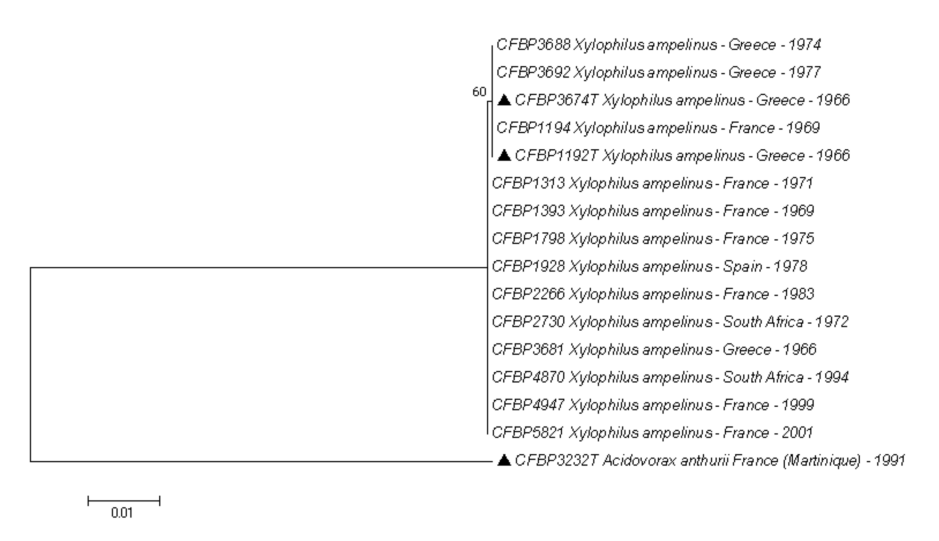
Figure 2. Phylogenetic tree reconstructed from concatenated partial sequences of gyrB and rpoD housekeeping genes for 15 strains of Xylophilus ampelinus and the type strain of Acidovorax anthurii as outgroup. The phylogenetic tree was reconstructed with concatenated alignments of all genes with MEGA 7.0.26 using the neighbor-joining method with 1000 bootstrap replicates, and the evolutionary distances were computed by using the Kimura two-parameter method. Triangles indicate the two CFBP accession corresponding of the type strain (accession duplicated in the CIRM-CFBP collection). The phylogenetic tree of the 93 Xylophilus ampelinus strains and all accession numbers of the sequences are available in Figure S1 and Table S1, respectively.

The gyrB and rpoD sequences were perfectly identical for 1382 base pairs (out of 1383) (Figure 2). The accession numbers for all gyrB and rpoD sequences are available in Table S1, the alignment of the sequences is available in Table S2, a version of the phylogenetic tree including the 93 X. ampelinus strains is available in Figure S1. A single 1 base-pair difference was observed in the rpoD sequence for 18 of the 92 strains, including the type strain of the species. A third gene (rpoB, results not shown) had been tested for a few strains leading also to perfectly identical sequences (thus, the analysis with this gene was not completed). These results are surprising considering that the strains have been isolated over a period of 35 years from different countries: Spain, Greece, France and South Africa. The number of analyzed genes is limited and may not reflect the actual diversity of the species. However, for other genera of plant-pathogenic bacteria, the analysis of only a few (1-3) housekeeping genes is enough to reveal the genetic diversity of the considered taxa. It is the case for Xanthomonas [38], Acidovorax [39] or Pectobacterium [40] for instance. A complete MultiLocus Sequence Analysis study of Curtobacterium flaccumfaciens [41] used 6 loci, but each locus independently was enough to reveal the diversity of the species. The homogeneity of X. ampelinus is thus remarkable.