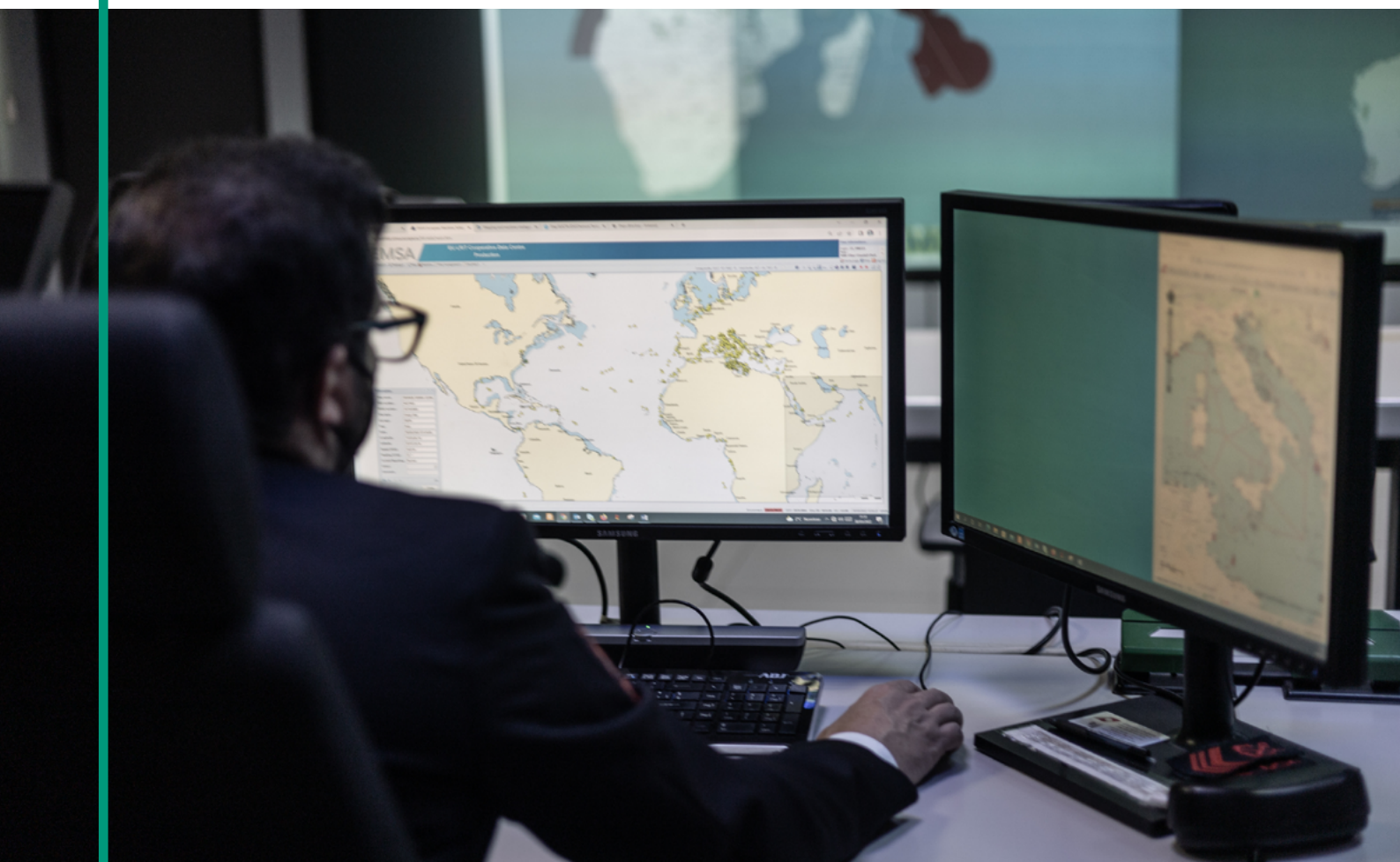
Italy, 30 March 2022, Italian National Coastguard officers monitor vessels fishing.