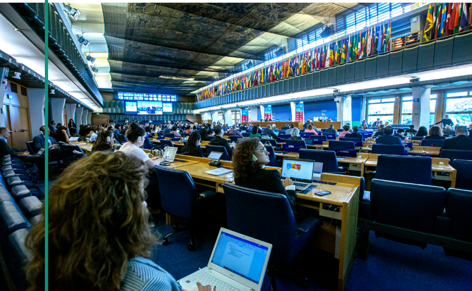
Italy, 15 October 2018, FAO Headquarters – CFS annual Plenary.