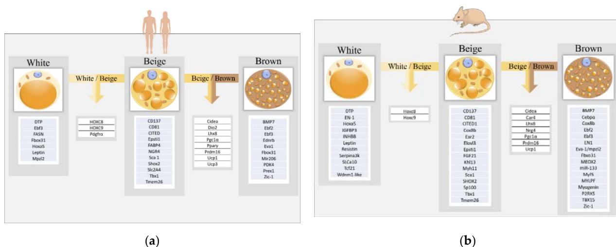
Figure 2. White, Beige and Brown adipocyte markers in Human and Mouse. We summed up here genes reported in the literature as markers of white (WAT), beige and brown adipose tissues (BAT) and shared by beige and WAT or beige and BAT in humans (a) and mice (b).