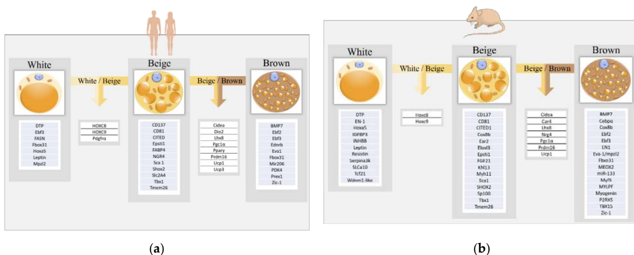
Figure 2. White, Beige and Brown adipocyte markers in Human and Mouse. We summed up here genes reported in the literature as markers of white (WAT), beige and brown adipose tissues (BAT) and shared by beige and WAT or beige and BAT in humans (a) and mice (b).