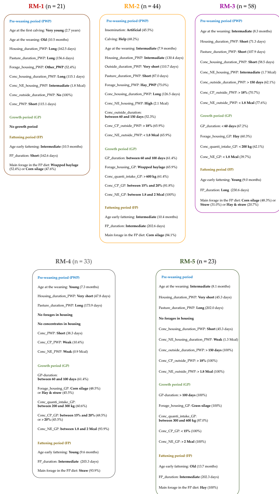
Figure 2. Description of the five rearing managements (RMs) applied throughout young bulls' life, with a focus on the rearing factors characterizing the most each RM, as described in Tables 3–5.