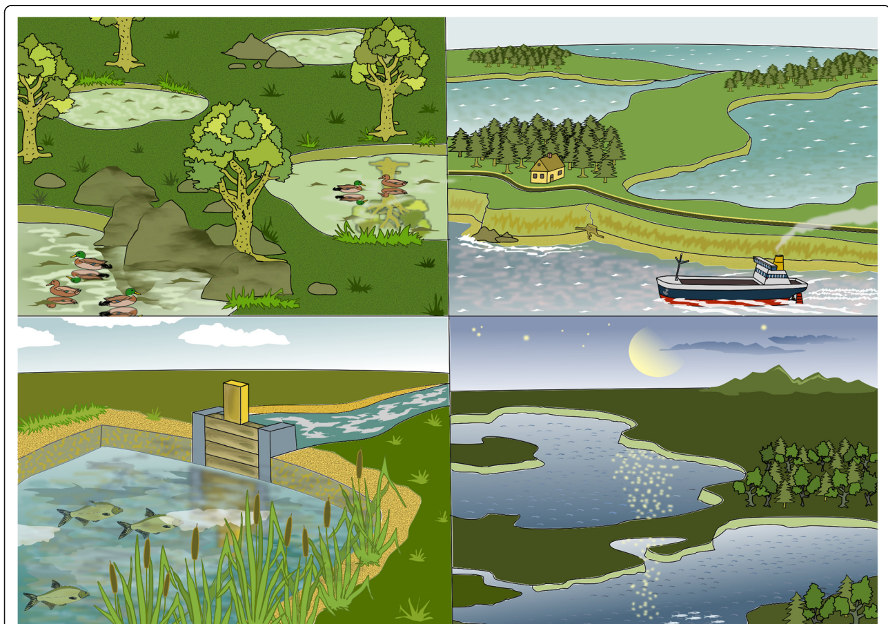
Fig. 1 Lakes come in many shapes and sizes, all of which have the potential to be monitored using environmental sensors and telemetry to reveal the nature of animal movement. In this grid we show lake size scales between small (left half) and large (right half) and experiments can be conducted in isolation (a single lake, lower half) or in a replicated design (upper half). Finding matching lakes to replicate experiments allows a degree of control that is difficult or impossible to achieve in other systems. Moreover, scaling lakes from small to large allows a degree of environmental realism desired for the experiments, with animals in small lakes using all habitats but in large lakes habitat segregation and different competitive mechanisms emerging

Before-after-control-impact studies are a gold-standard in the applied environmental sciences, particularly in freshwater ecology, and are particularly useful to identify how common conservation and management actions operate at ecologically realistic scales. Lakes offer excellent experimental arenas for such types of studies. Experiments could, for example, tackle questions of habitat enhancement or degradation, stocking and introductions, selective harvesting and effectiveness of protected areas. Smaller pond ecosystems could also be experimentally warmed to study impacts of climate change. Replicated lakes could be used to study impacts of invasive species, the release of chemicals, light pollution, and exploitation pressures. Stock assessment methods could be calibrated and gear biases and estimation of catchability could be quantified in situ using telemetry. Indeed, whole lake telemetry constitutes an excellent opportunity to estimate the otherwise “unmeasurable” (Fig. 2), such as size-dependent mortality, predator-prey interactions (e.g.