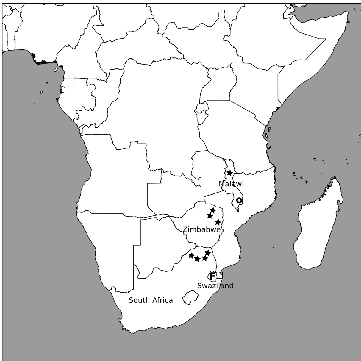
Fig. 4. Collection localities of males of Dorsomitius neavei (Kimmins, 1949) gen. et comb. nov. (circle), D. tjederi sp. nov. (stars) and Dorsomitius sp. ♀ in Swaziland (F).

belongs to an unidentified genus. This latter specimen, with tip of abdomen missing (possibly dissected by van der Weele), was designated by van der Weele as the male of the female S. buyssoni . Concerning this last specimen, it should be noted that the third abdominal sternite harbors a marking very similar to the one of Dorsomitius gen. nov. and its relative length is also the same as in male Dorsomitius gen. nov. However, if the sex determination made by van der Weele is correct, we consider that the shape of the first abdominal tergite, which is weakly sclerotized and divided along the dorsal midline into a pair of dorso-lateral plates and not developed dorsally into a forked projection, clearly differentiates it from Dorsomitius gen. nov. Examination of this specimen shows that the color pattern of the third abdominal sternite in Dorsomitius gen. nov. is very probably shared with another genus. In the case of females, the separation of both genera is currently not possible and necessitates the examination of additional material.