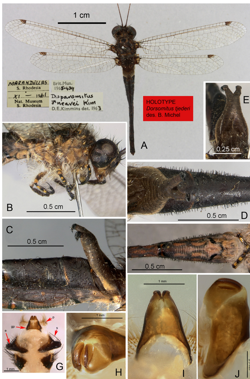
Fig. 2. Dorsomitrus tjederi gen. et sp. nov., holotype, ♂ (NHMUK 1963-439). A. Habitus with associated labels. B. Lateral view of head and thorax. C. First to third abdominal tergites, right lateral view. D. Same as previous, dorsal view. E. First abdominal tergite, front view. F. Base of abdomen, ventral view. G. Terminalia and genitalia, dorsal view. H. Gonarcus-parameres complex, caudal view. I. Same as previous, dorsal view. J. Same as previous, left lateral view.